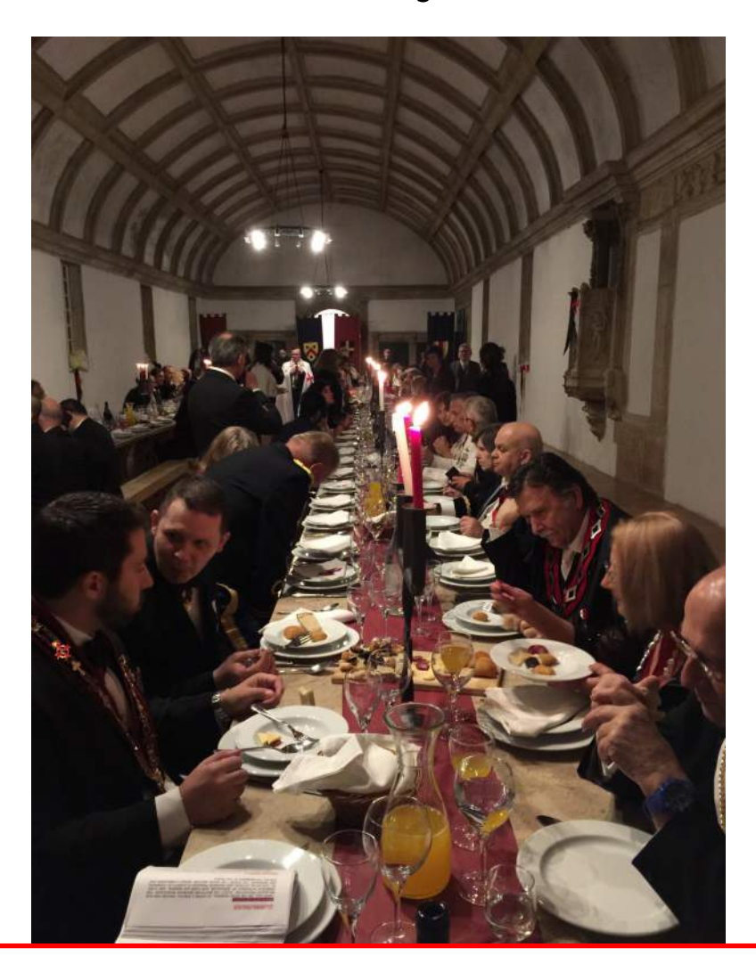
Saturday evening Gala Dinner in Tomar Castle

You can request the Annual Submissions document from the Chancellor if you are interested, and see any meeting documents on the Members Section of <a href="www.osmth.org">www.osmth.org</a> In order to view the member's section, please let the Grand Prior know and a password will be generated for you. This is a resource area open to all knights, dames and novices in good standing, not just your representatives to the various OSMTH meetings.