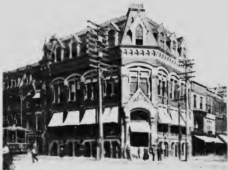
OLD OFFICE OF THE BANK

the building then occupied by the Federal Bank of Canada, which has just been pulled down to make room for the new office of The Canadian Bank of Commerce. This building was erected in 1872 by the Federal Bank of Canada, and at the time of its liquidation and retirement from business was purchased by The Canadian Bank of Commerce, which occupied it until last April, when temporary premises were secured during the erection of the new office.