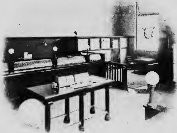
WOMEN'S WRITING ROOM

On the right hand side of the entrance is the writing room for women. This room is