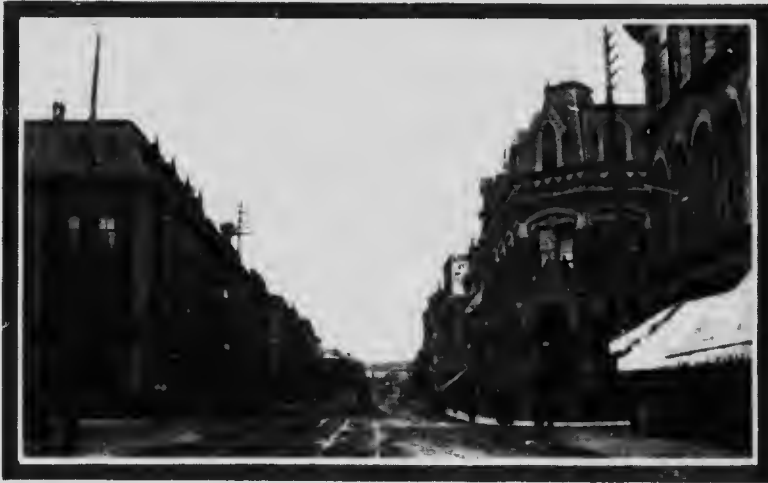
RICHMOND STREET. LOOKING NORTH