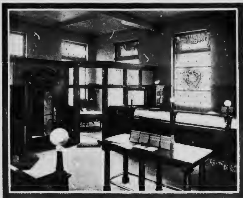
MAIN DOORWAY AND MANAGER'S ROOM

The manager's room occupies the corner of the building immediately on Dundas and Richmond Streets. The woodwork is of mahogany, and the walls are finished similarly to those of the main office. A handsome mahogany mantel and fireplace occupy one corner of the room which is suitably furnished in the same wood.