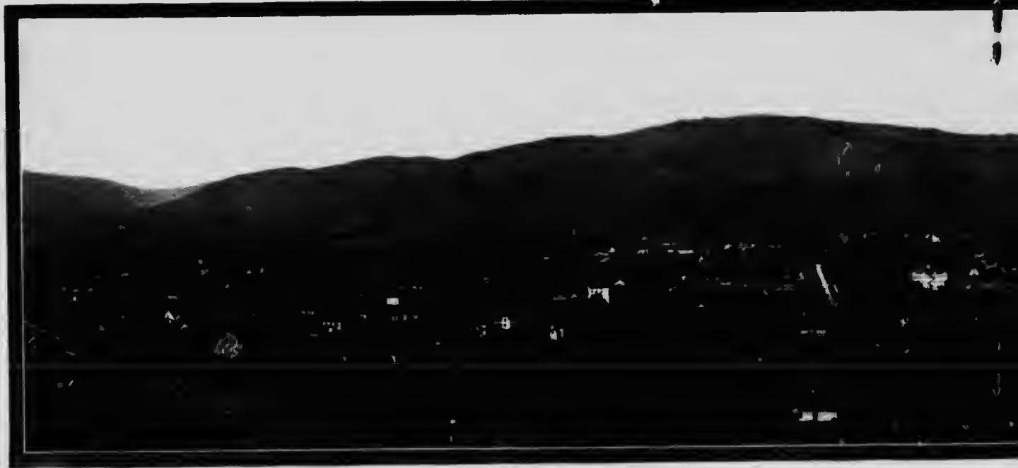
PANORAMIC VIEW OF VERMONT