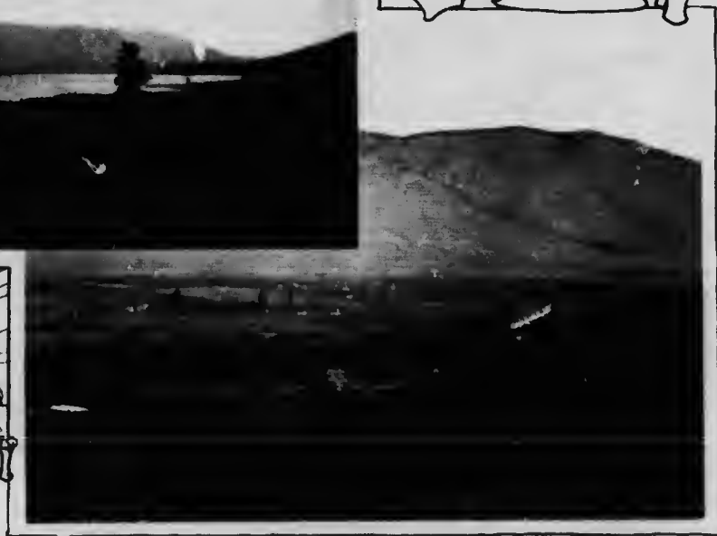
Orchard Scene Near Vernon, B. C.