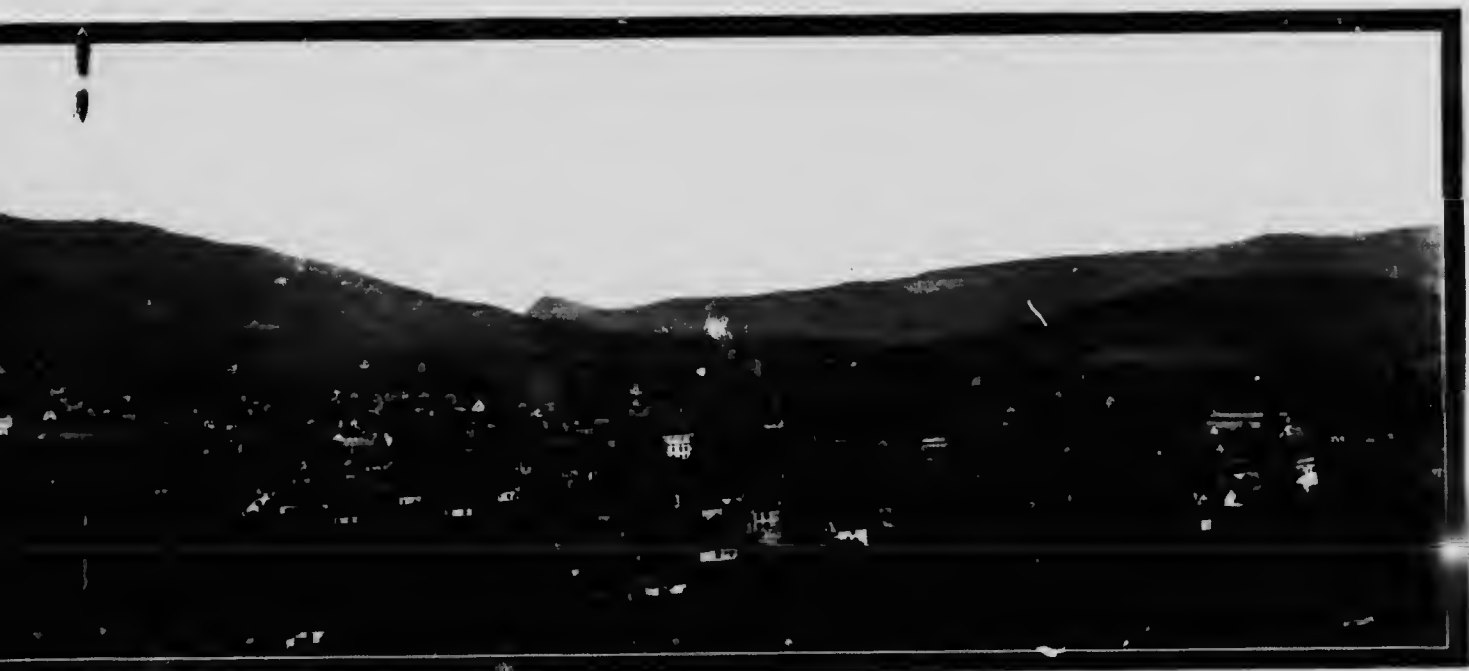
W OF VERNON AND DISTRICT