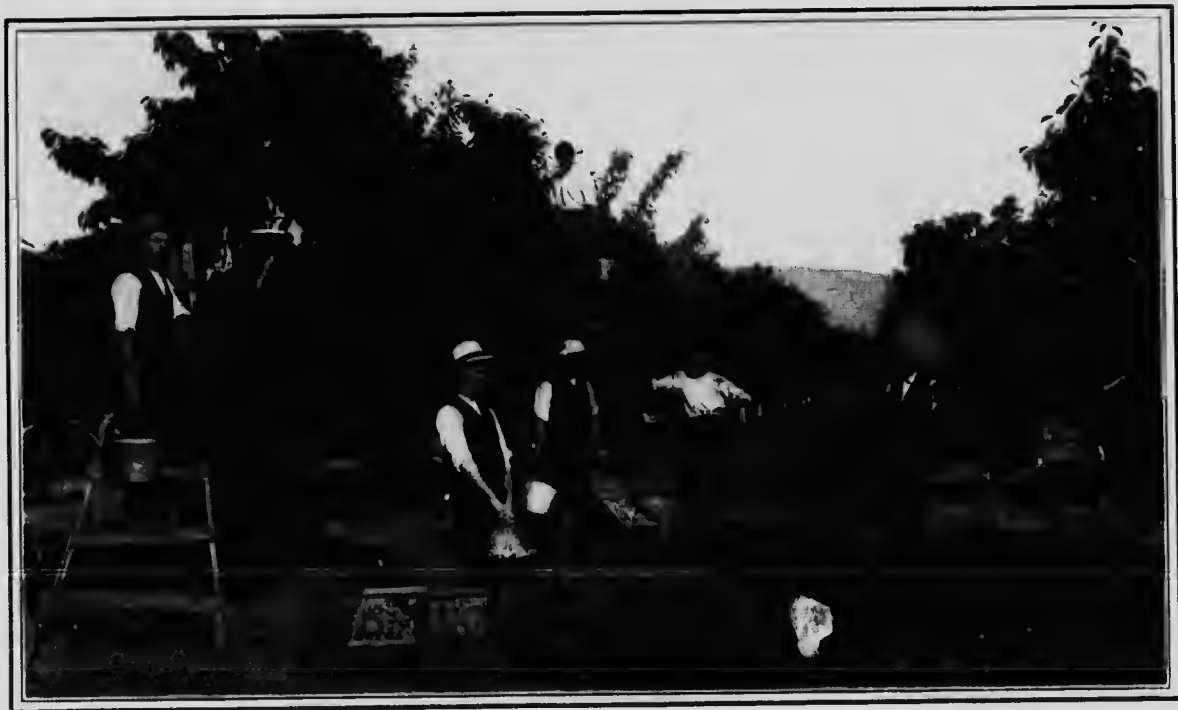
An Orchard Scene—Kelowna, B. C.