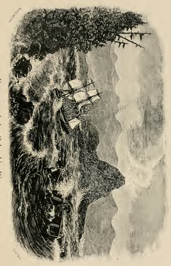
Entrance of the Columbia River Ship Tonquin crossing the bar, 25th March, 1811