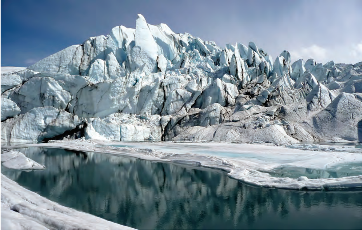
Photo 8.1. Mouth of the Matanuska Glacier in Alaska.