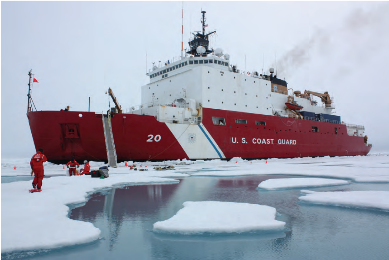
Photo 1.1. On July 6, 2011, the U.S. Coast Guard Cutter Healy parked in an ice floe for the 2011 Impacts of Climate on the Eco-Systems and Chemistry of the Arctic Pacific Environment (ICESCAPE) mission's third ice station in the Chukchi Sea.