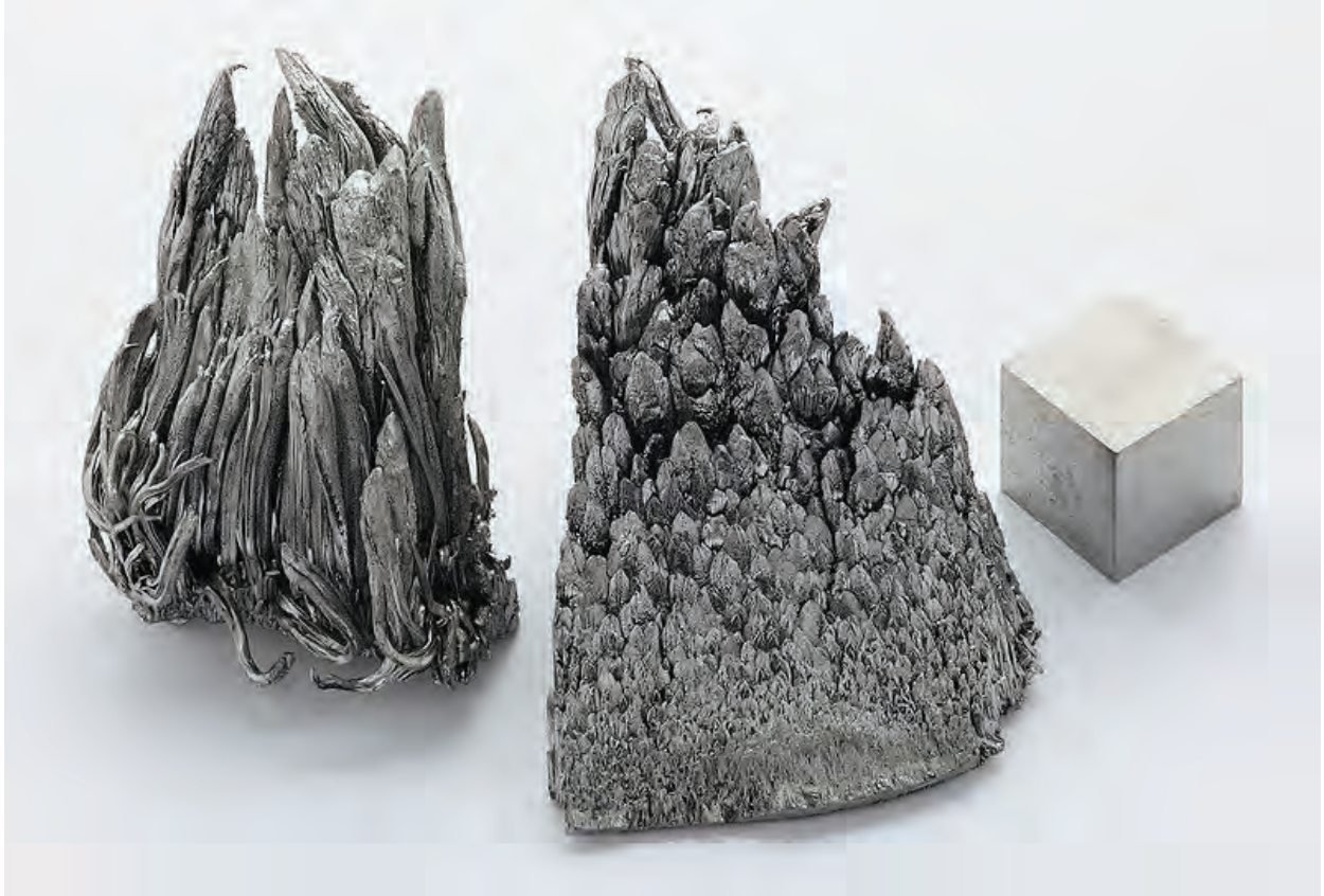
Photo 3.3. Rare earth elements.