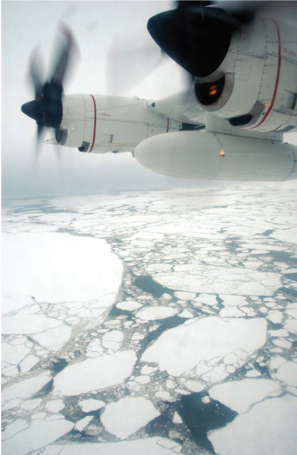
Photo 4.2. A U.S. Coast Guard HC-130 Hercules airplane, based at Barrow, Alaska, flies over pack ice during a patrol of the Bering Strait.

http://cgvi.uscg.mil/media/main.php?g2_itemId=184952. This image is a work of a U.S. military or Department of Defense employee, taken or made as part of that person's official duties. As a work of the U.S. federal government, the image is in the public domain.