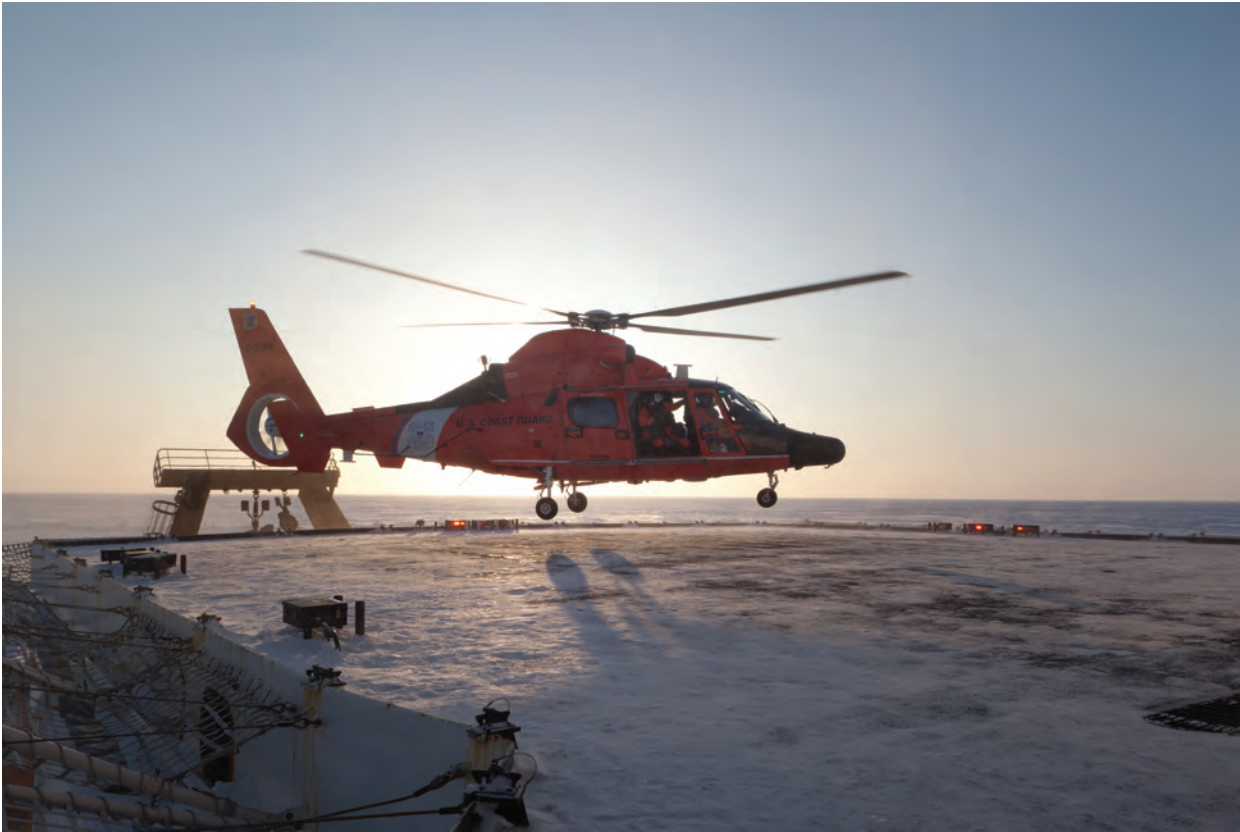
Photo 7.2. An air station Kodiak MH-65 Dolphin helicopter takes off from the flight deck of the U.S. Coast Guard Cutter Healy 67 miles south of Nome, Alaska, January 11, 2012. The helicopter crew is forward deployed aboard the cutter as an ice reconnaissance and search and rescue asset.

Source: U.S. Coast Guard photo by Seaman Mathew Rupp. http://commons.wikimedia.org/wiki/File:An_MH-65_Dolphin_helicopter_crew_takes_off_from_the_flight_deck_of_the_USCGC_Healy_(WAGB-20)_67_miles_south_of_Nome,_Alaska,_Jan_120111-G-ZZ999-006.jpg . This image is a work of a U.S. military or Department of Defense employee, taken or made as part of that person's official duties. As a work of the U.S. federal government, the image is in the public domain.