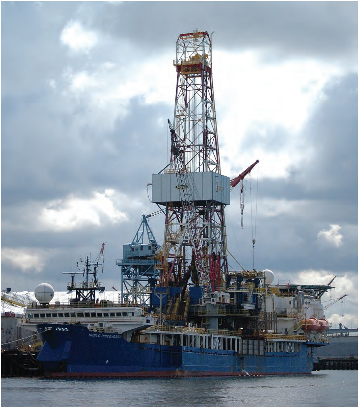
Photo 3.1. The oil drilling ship Noble Discoverer , seen April 5, 2012, in the port of Seattle before its trip to Alaska for the summer Arctic drilling season.