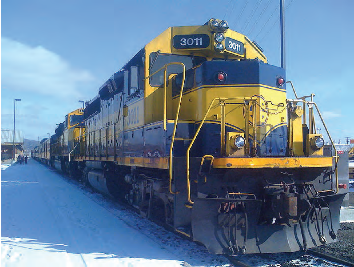
Photo 3.2. Alaska railroad locomotive.