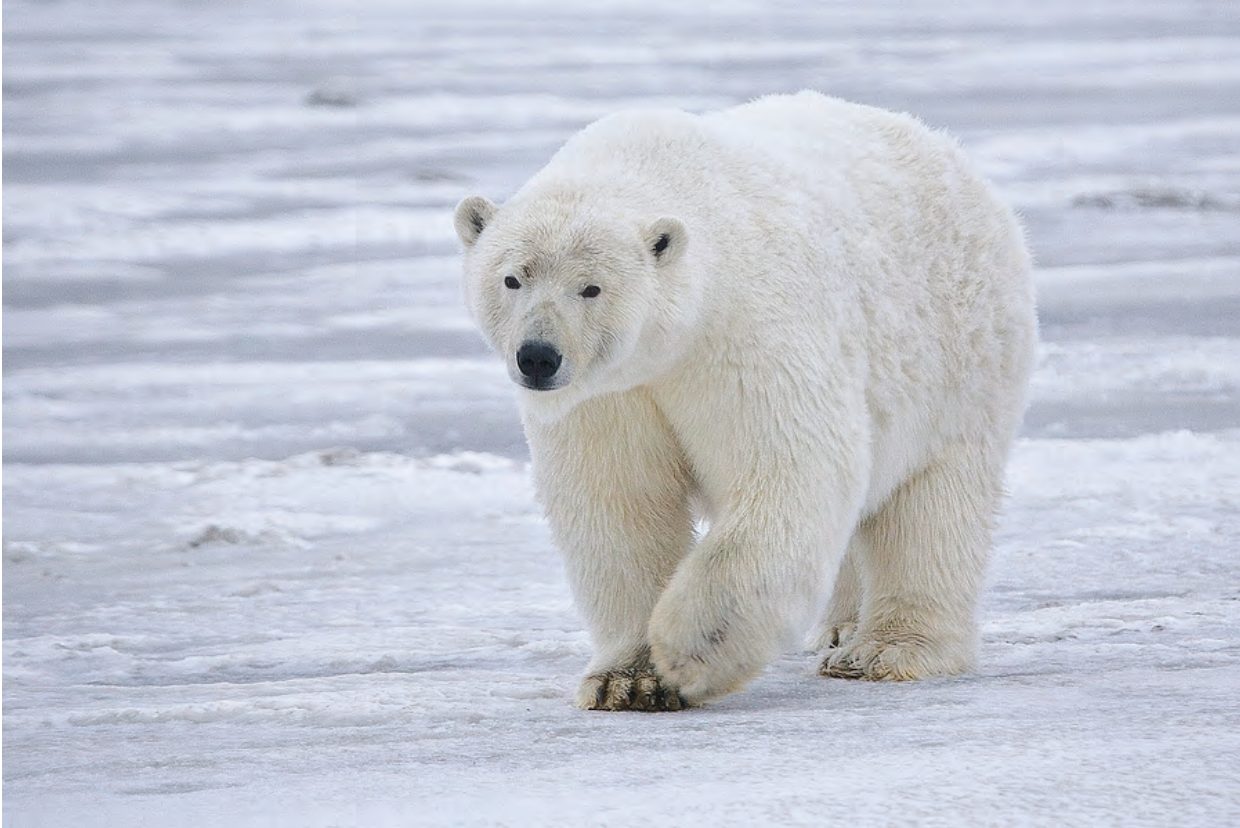
Photo 6.1. Sow polar bear near Kaktovik, Barter Island, Alaska.