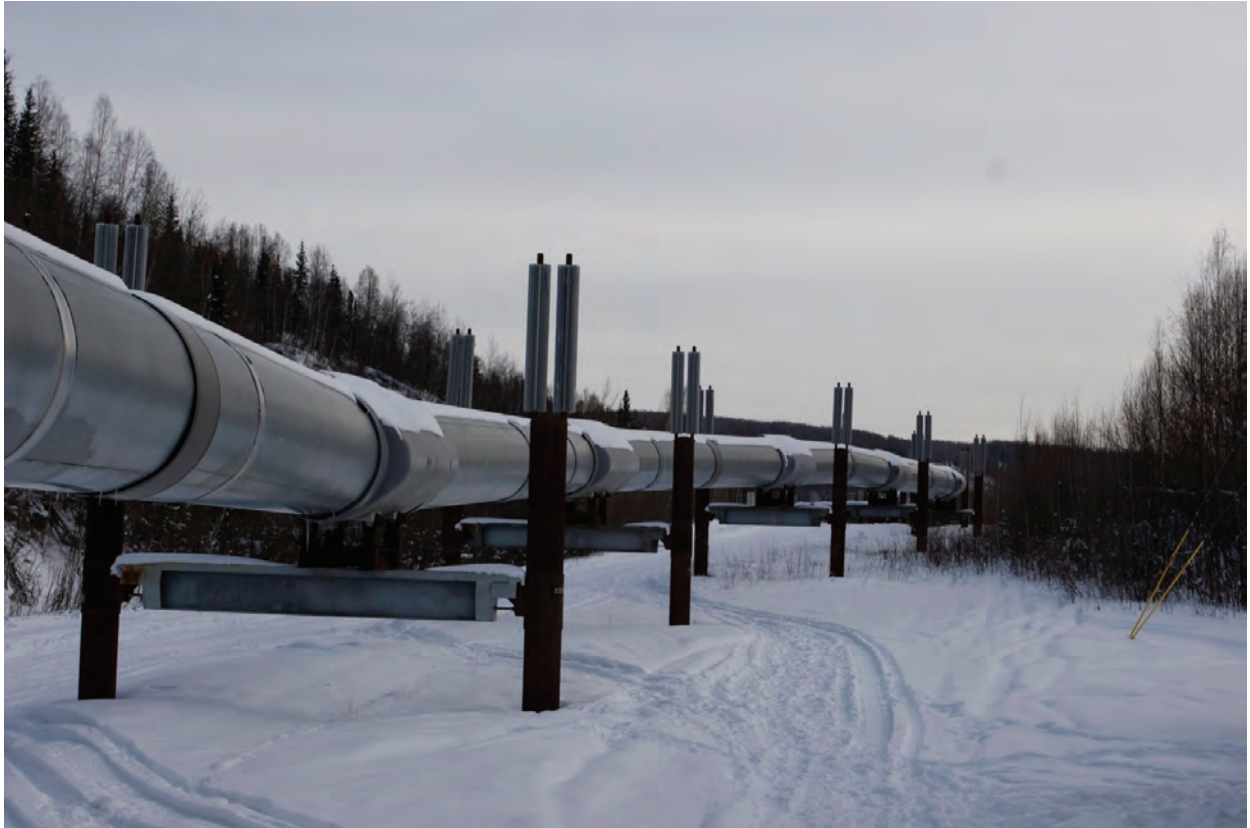
Photo 2.2. Trans-Alaska pipeline in Fairbanks, Alaska, off the Steese Highway.