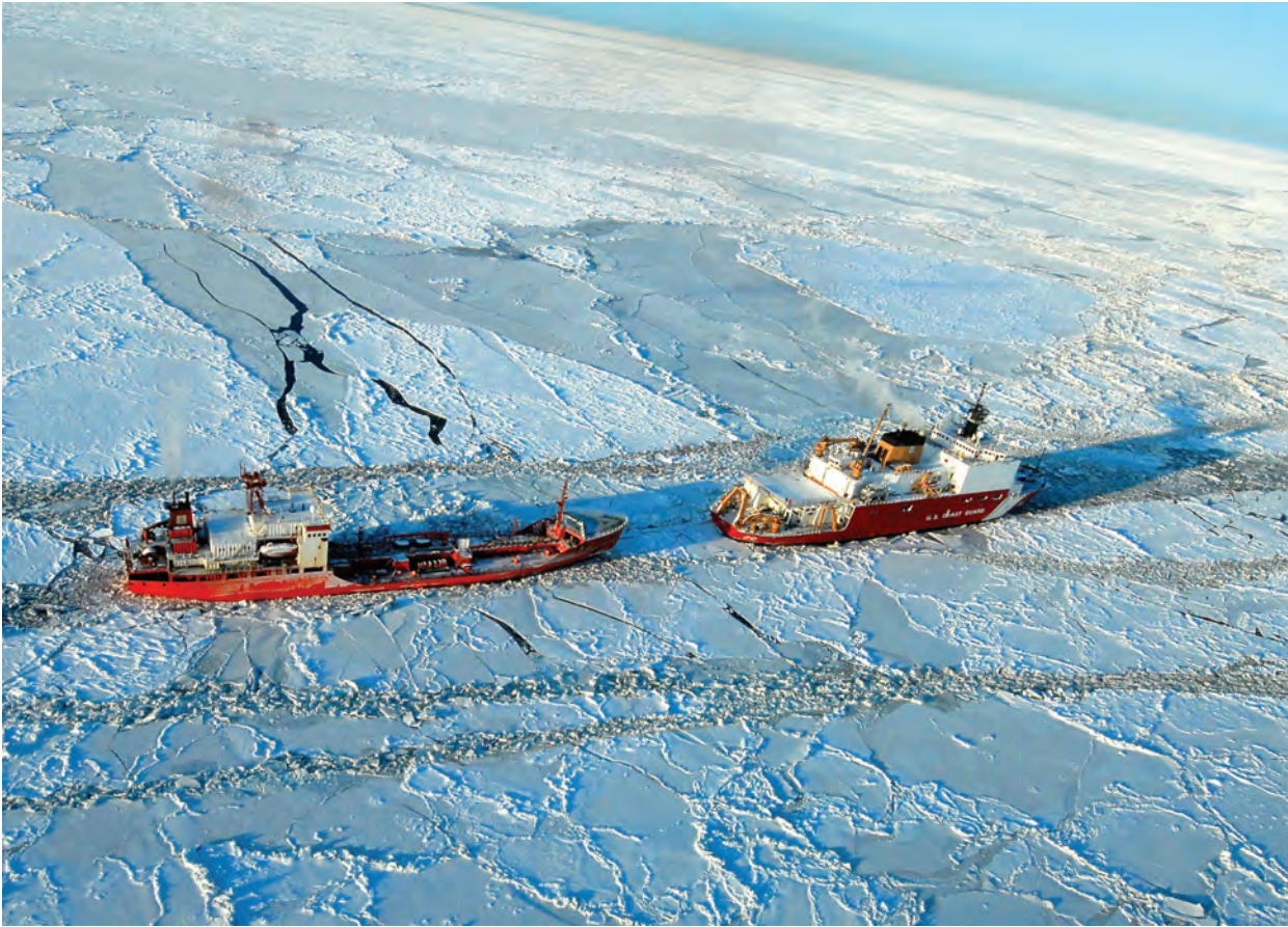
Photo 4.1. The U.S. Coast Guard Cutter Healy escorts the Russian-flagged tanker Renda 250 miles south of Nome, January 6, 2012. The vessels are transiting through ice up to five feet thick in this area of the Bering Sea.

Source: U.S. Coast Guard photo by Petty Officer First Class Sara Francis. http://cgvi.uscg.mil/media/main.php?g2_itemId=1489507 . This image is a work of a U.S. military or Department of Defense employee, taken or made as part of that person's official duties. As a work of the U.S. federal government, the image is in the public domain.