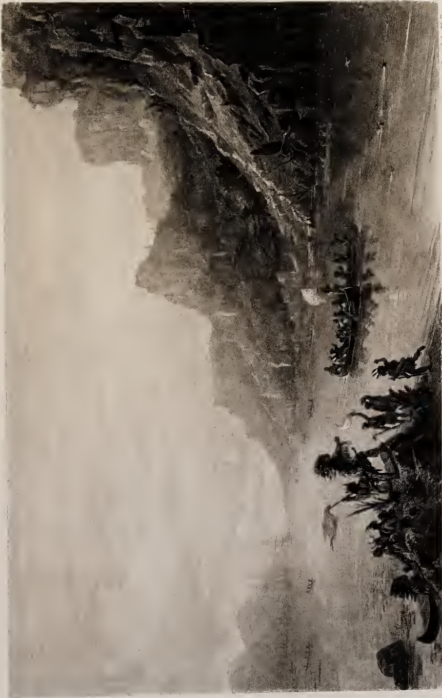
Geopid & C o Paris.