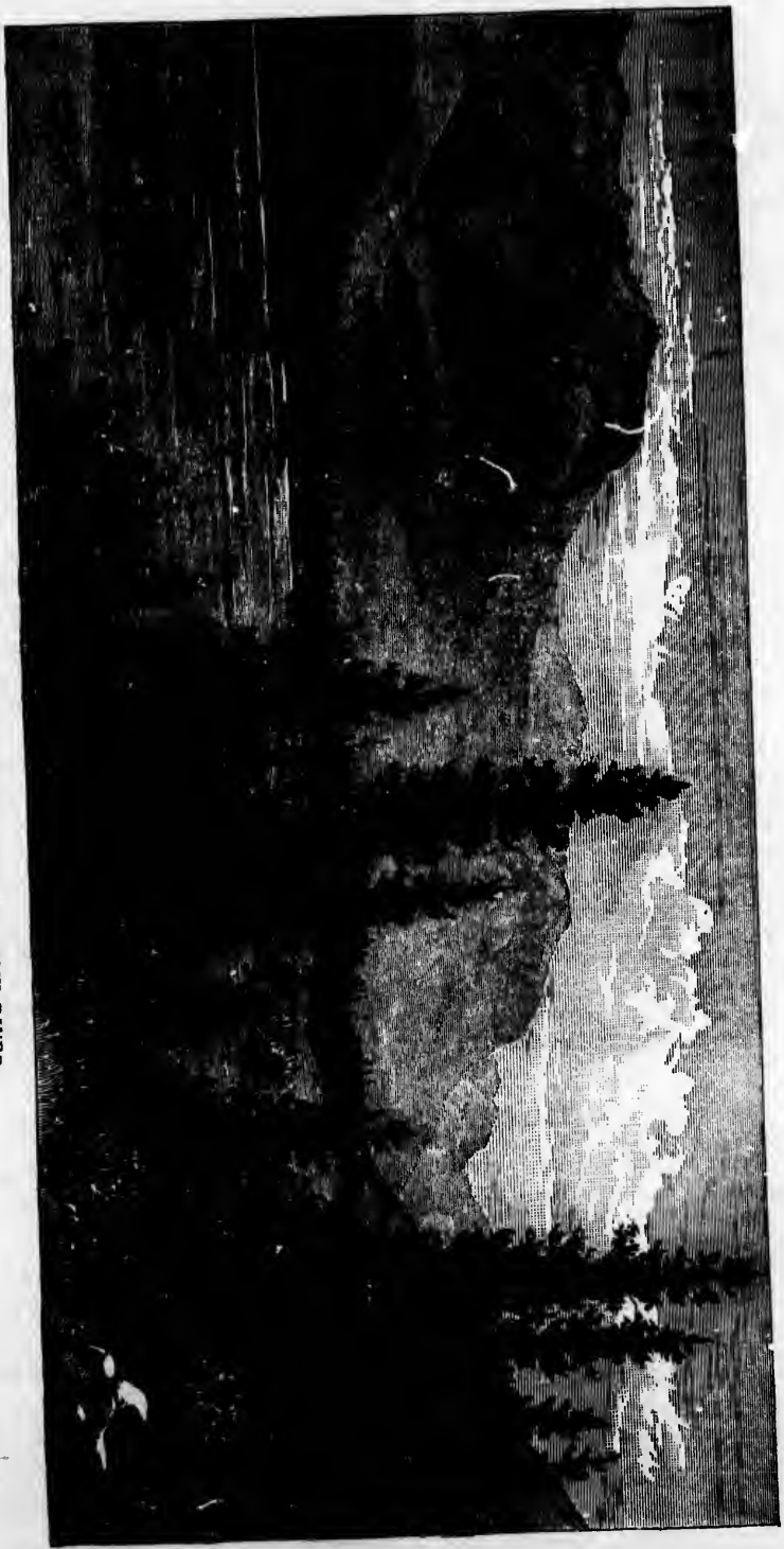
APPROACHING THE ROCKY MOUNTAINS—BOW RIVER.