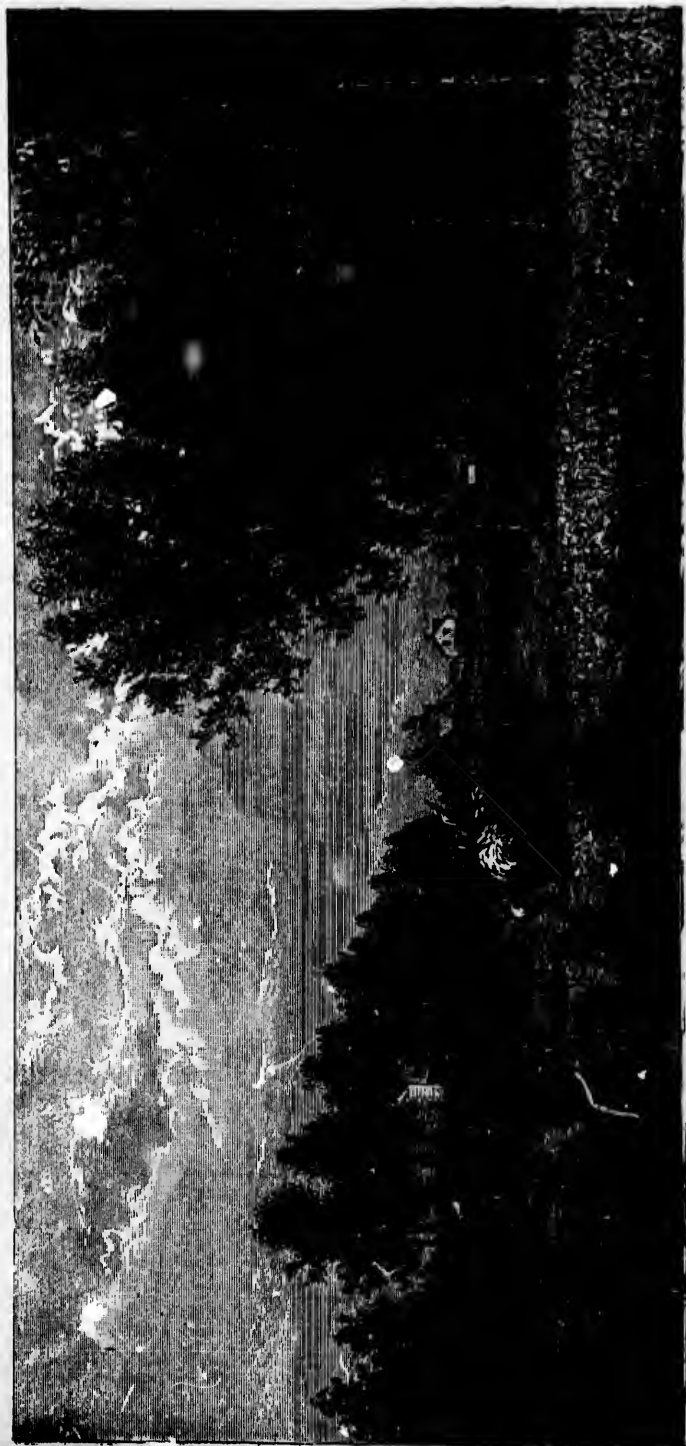
HOMESTEAD FARM AT KILDONAN, NEAR WINNIPEG.—Engraved from a Photograph.