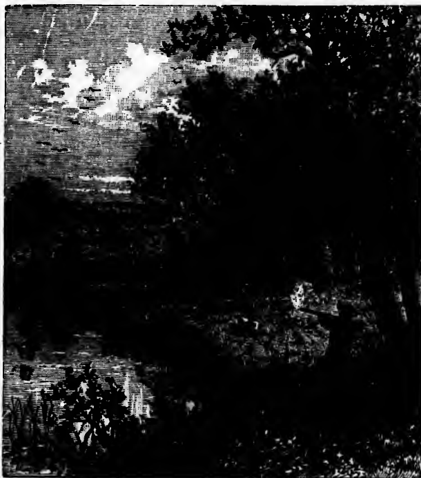
HUNTING SCENE ON THE SOURIS RIVER.