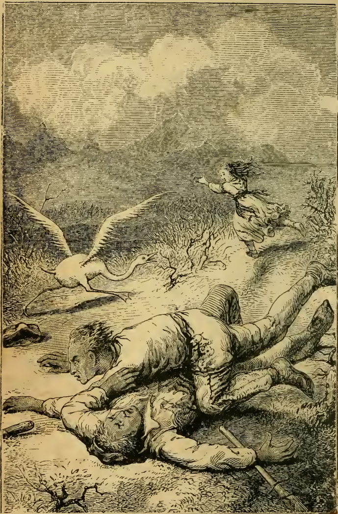
A WILD-GOOSE CHASE.