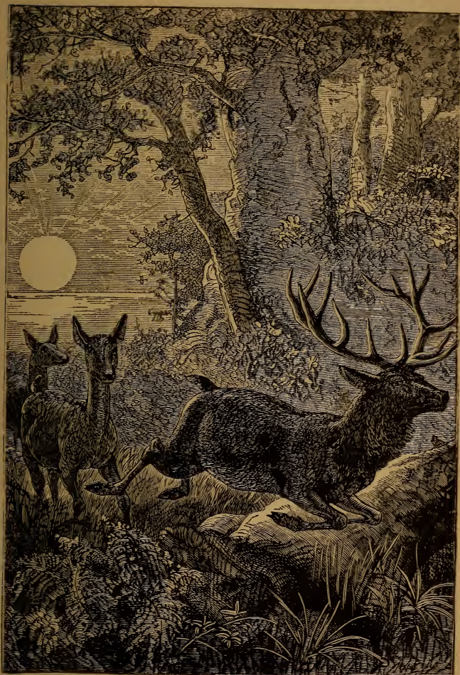
HENRY'S FIRST STAG.