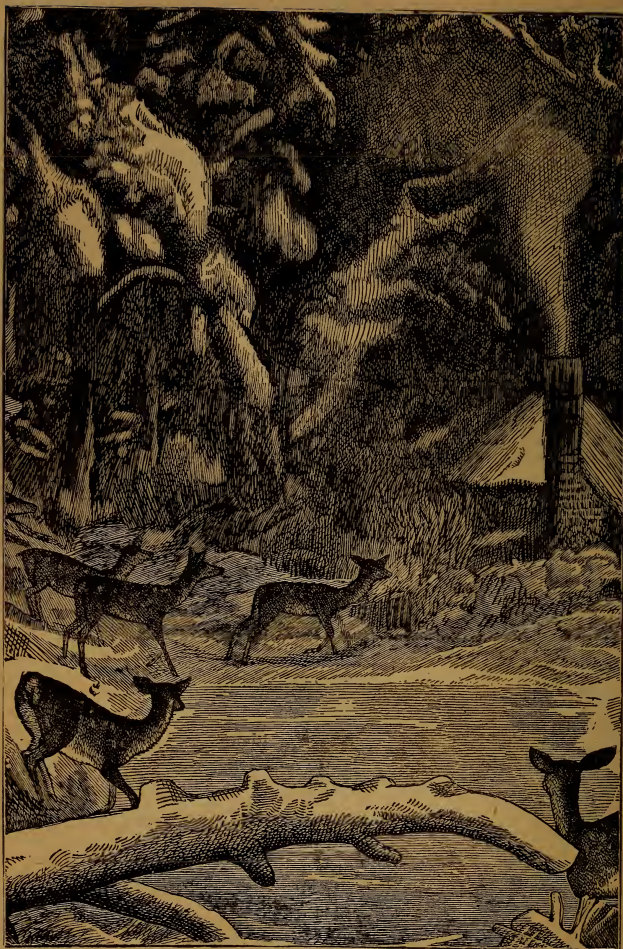
A SCENE IN OUR FIRST WINTER.