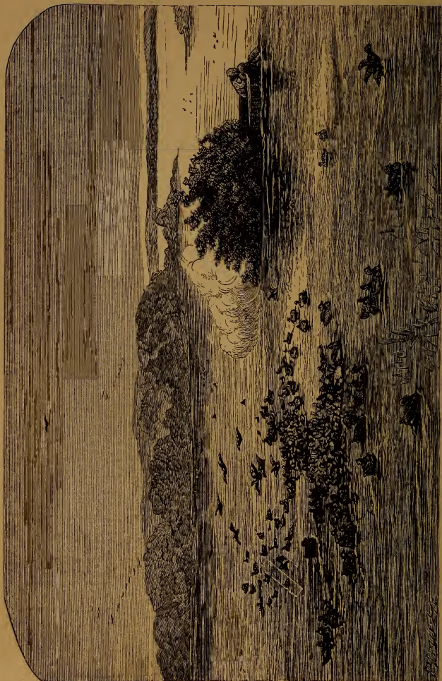
INDIAN DUCK SHOOTING.