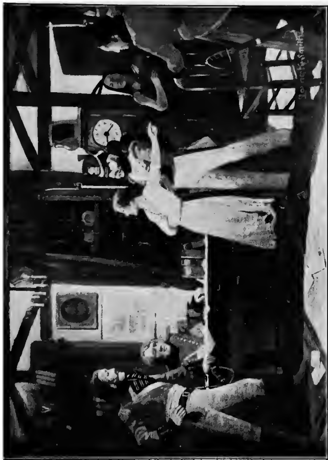
Laura Secord warning Fitzgibbon of the planned attack against him.