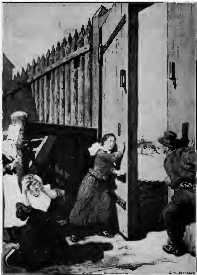
Madeleine de Verchères closing the door of the Fort against the Indians.