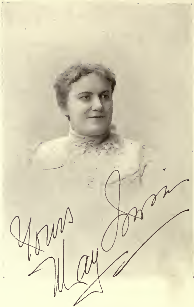
MISS MAY IRWIN.