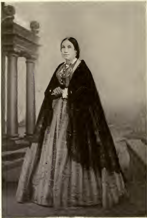
MRS. THOMAS D'ARCY M'GEE.