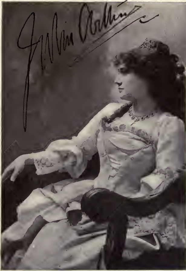
MISS JULIA ARTHUR (MRS. CHENEY).