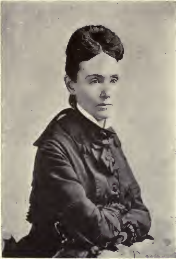
MRS. MAY AGNES FLEMING.