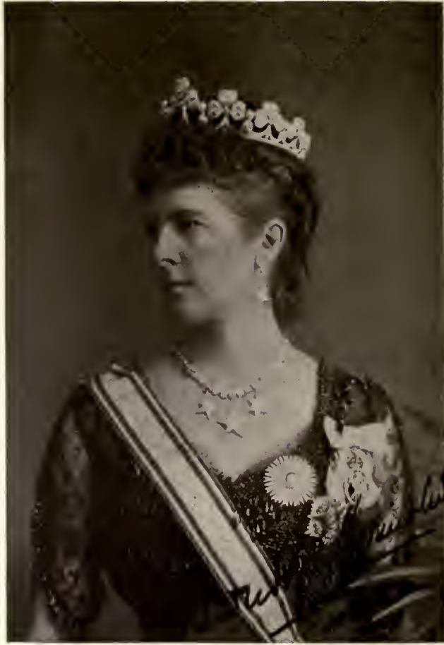
THE MOST HONOURABLE THE MARCHIONESS OF DUFFERIN - AND AVA, V.A., C.I.

From a photograph by Bourne & Shepherd, India.