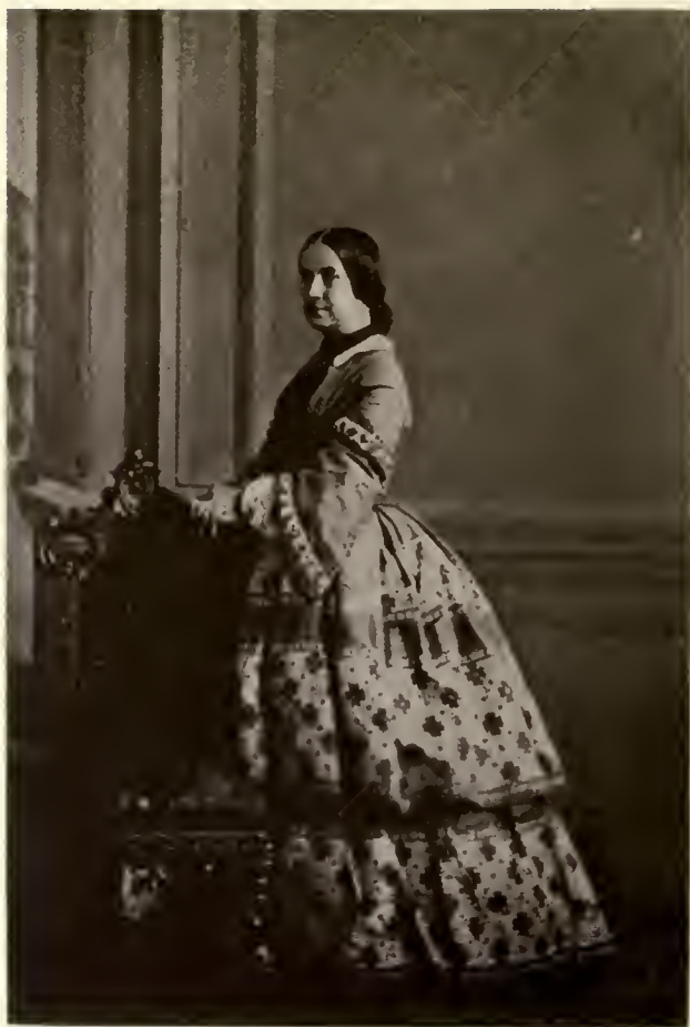
THE RIGHT HONOURABLE THE MARCHIONESS OF NORMANBY.