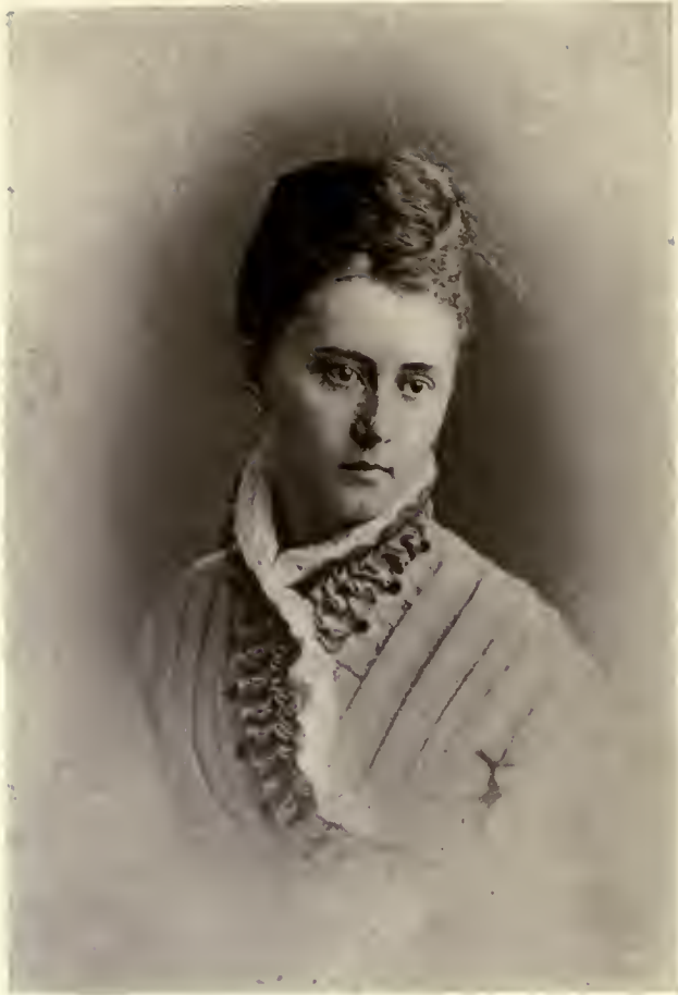
Isabella Valancy Crawford