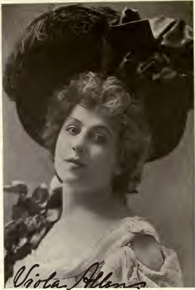
MISS VIOLA ALLEN.