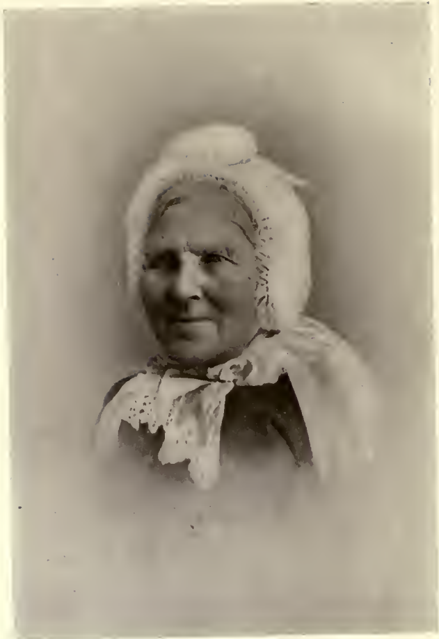
Catharine Parr Traill