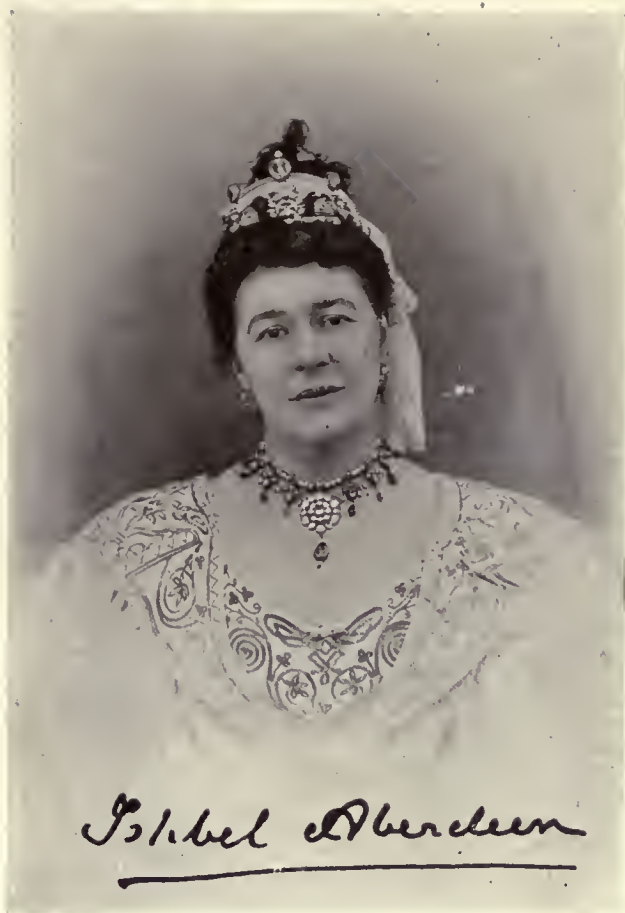
THE RIGHT HONOURABLE THE COUNTESS OF ABERDEEN, LL.D.