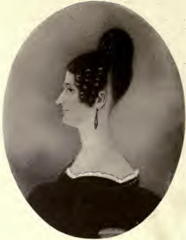
THE RIGHT HONOURABLE THE COUNTESS CATHCART.

Enlarged from a miniature taken in 1835. Kindly furnished by the present Earl Cathcart.