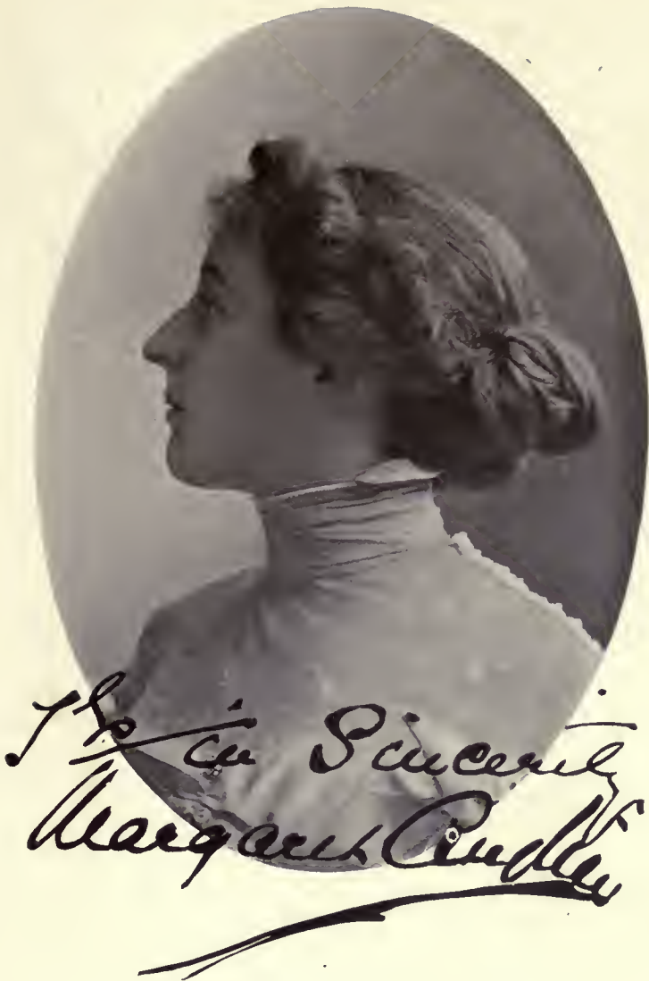
MISS MARGARET ANGLIN.