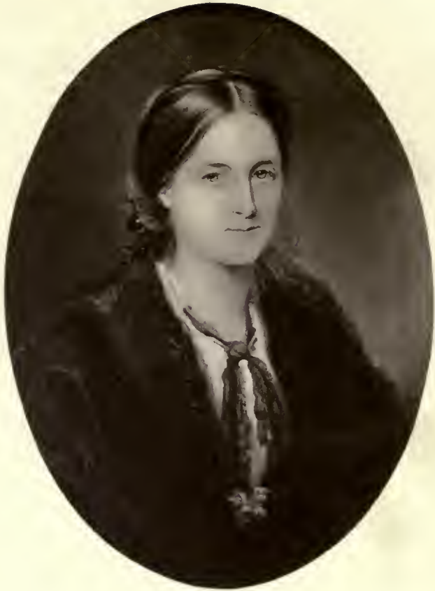
THE RIGHT HONOURABLE SOPHIA, COUNTESS OF ALBEMARLE.

Copied from an engraving kindly supplied by the family.