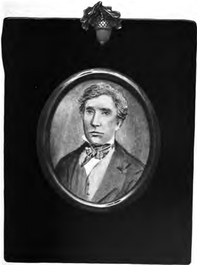
DONALD A. SMITH, 1838