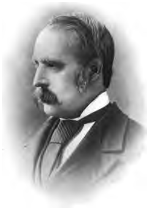
HON. WILLIAM McDOUGALL, C.B.