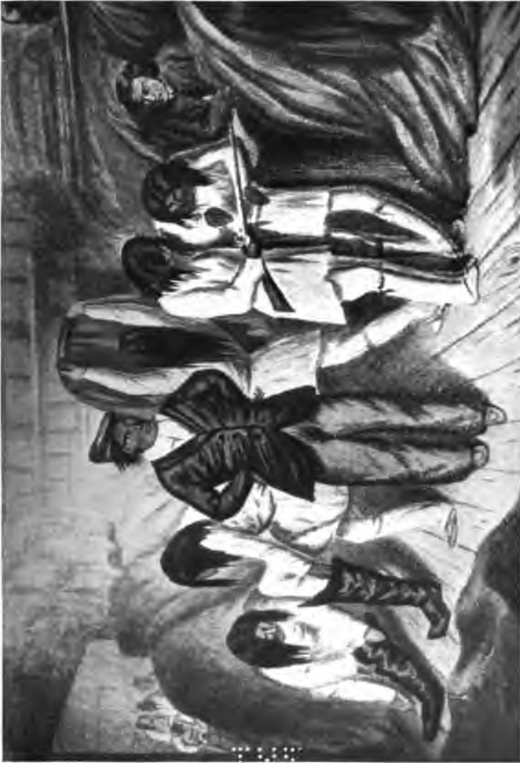
HUDSON'S BAY COMPANY'S POST AT MINGAN

From the original drawing by William Hind