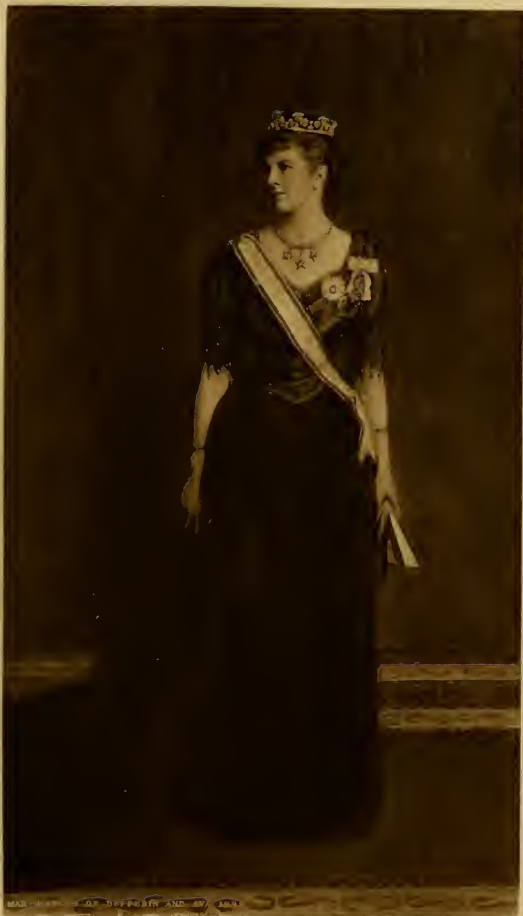
The Marchioness of Dufferin & Ava from the picture by J. J. Shannon, A.R.A. 1889.