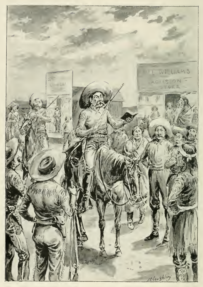
"Boys, I allus carries my Guide-Book." (Page 30.)