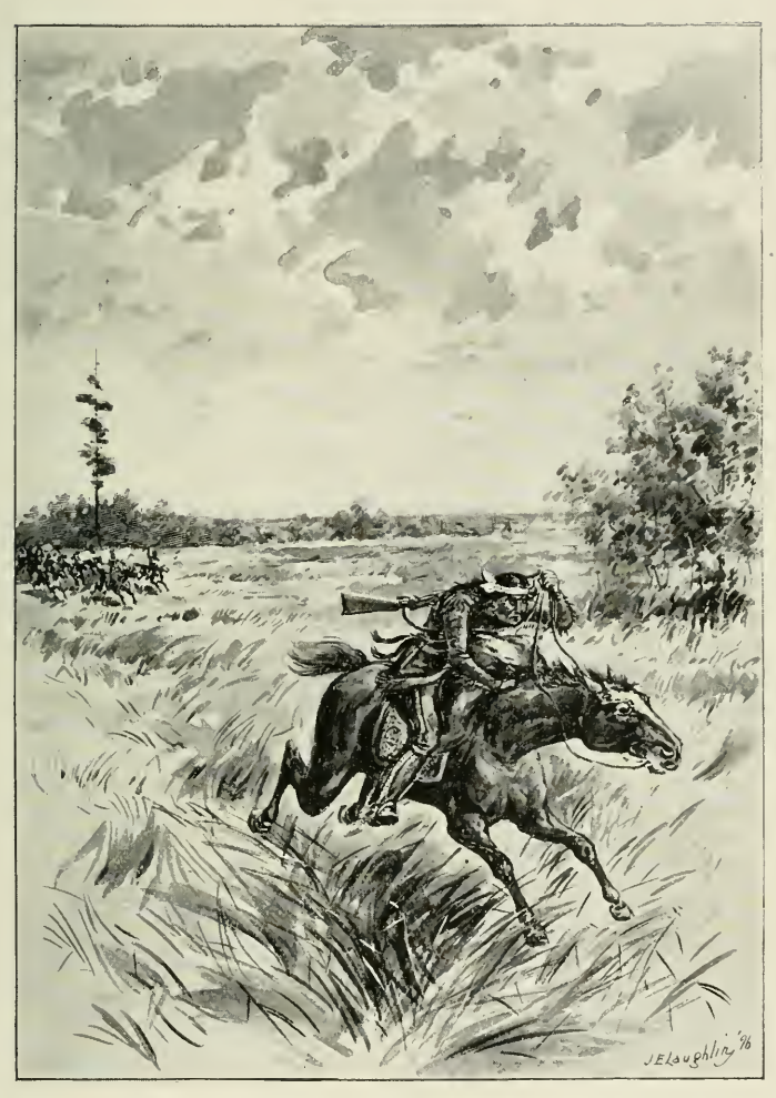
^{\prime\prime} He grasped more firmly a bundle which lay across his saddle."