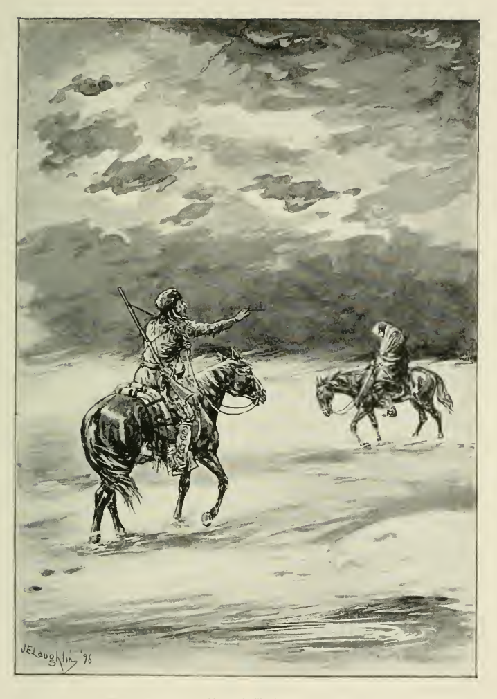
SNOW-BLIND AND LOST ON THE PRAIRIE.