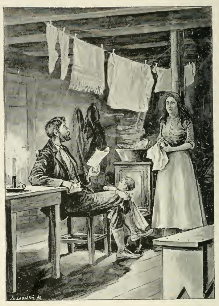
"Napiake," he said sadly, "I am going on a long journey across the sea." \,