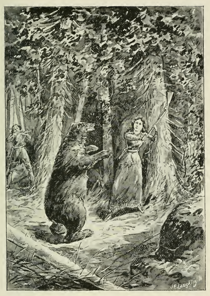
"His trusty rifle had pierced the brain of the savage animal."