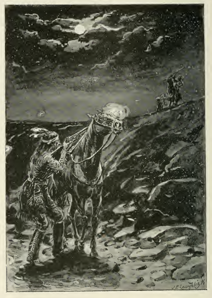
" As they approached I levelled my gnn and shot the leader,"