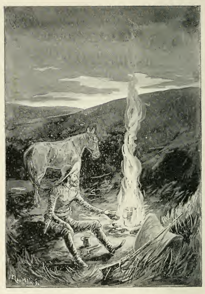
"He built a fire and then hastily cooked his meal."