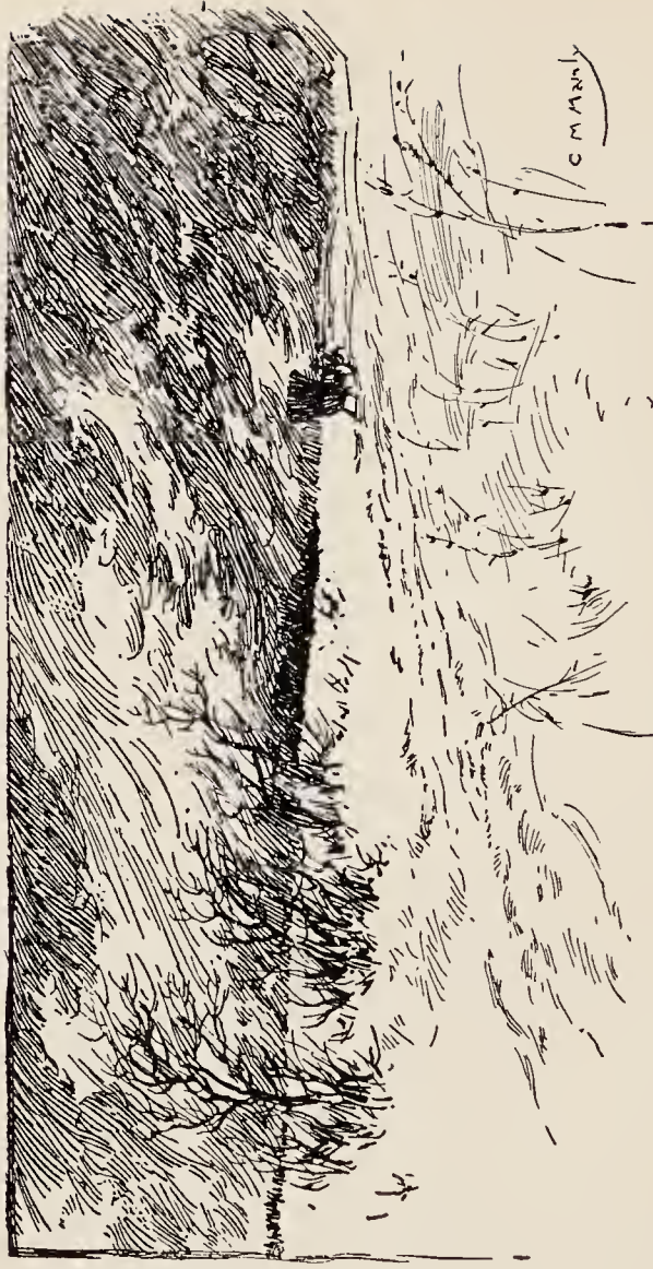
"But I had not gone very far . . . when the trees began to bend under the impact of that squall."—Page 154.