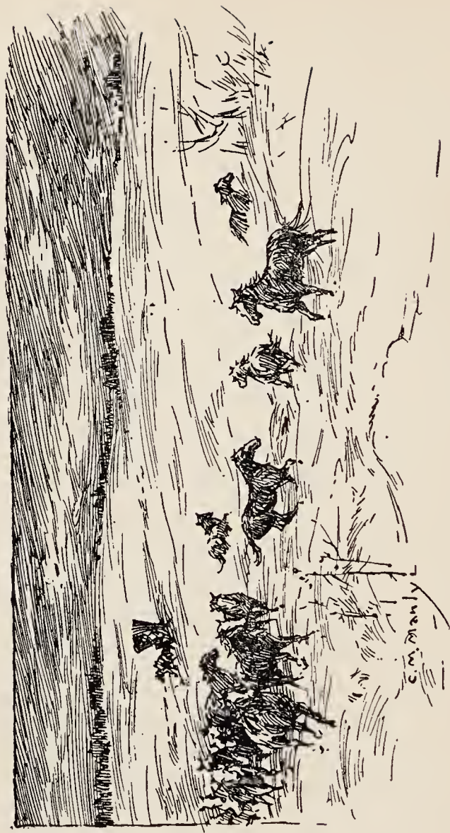
“ . . . they scattered away from the trail at our approach—Page 197.