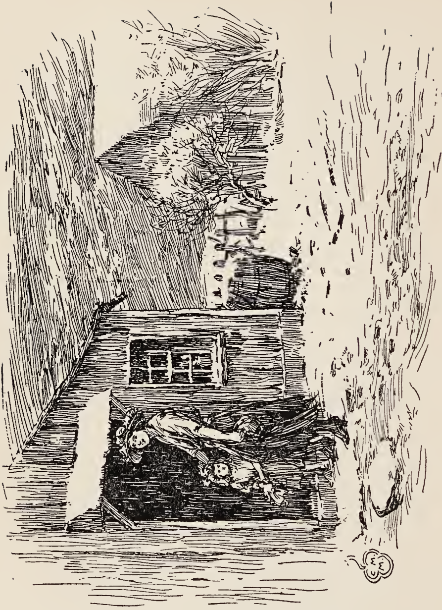
“And there on the porch stood the tall, young smiling woman . . .” —Page 100.