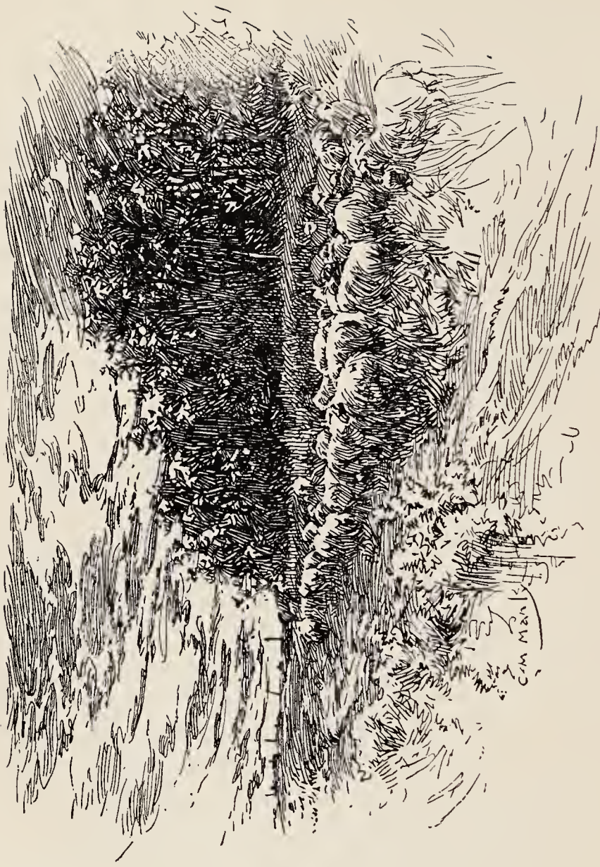
A fine bluff of stately poplars that stood like green gold in the evening sun."—Page 26.