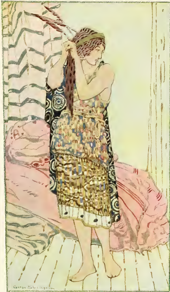
SHE WAS VERY BEAUTIFUL AND GENTLE