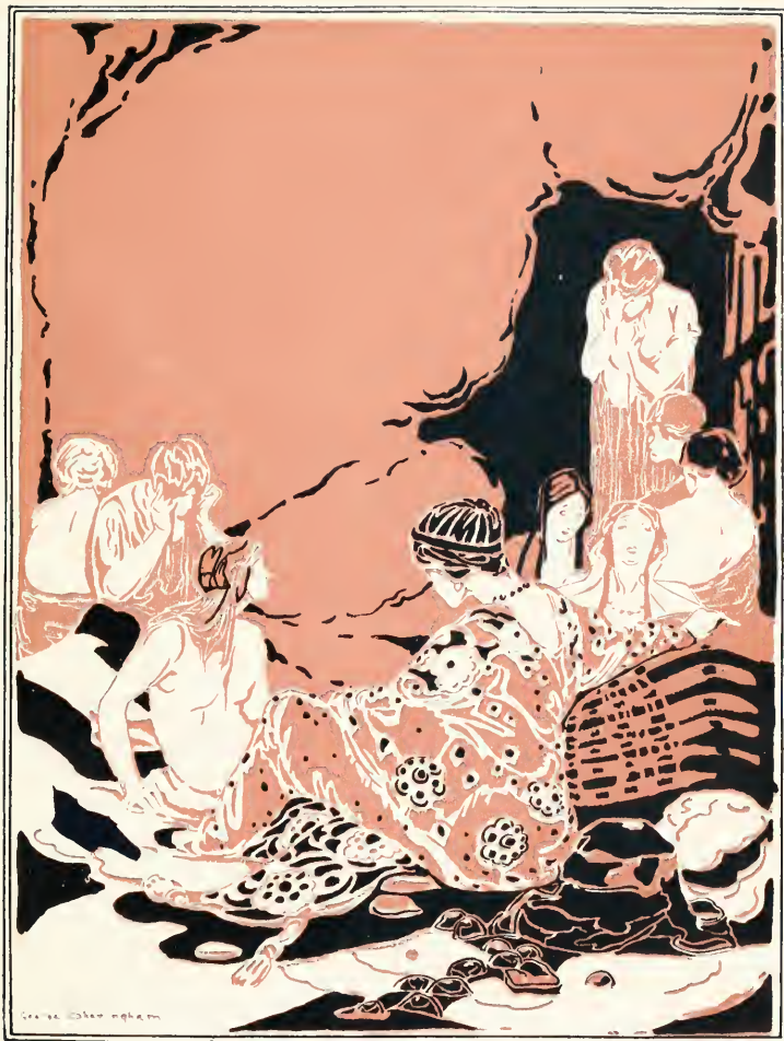
MANY WOMEN SAT AROUND IN A CIRCLE, ALL SAD AND WEeping.