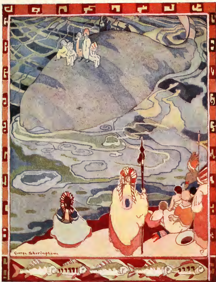
GLOOSKAP GATHERED HIS PEOPLE ON THE SHORE AND BADE THE WHALES CARRY THEM TO THEIR OLD HOME.