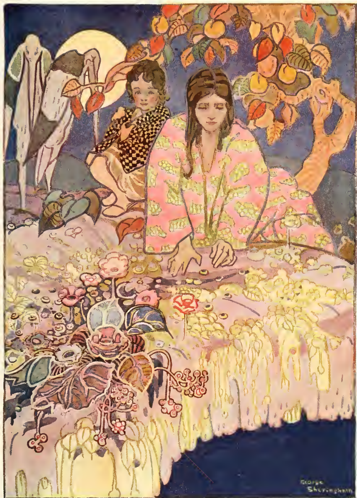
THE GIRL LOOKED THROUGH THE HOLE, AND SAW THE EARTH FAR BENEATH HER.