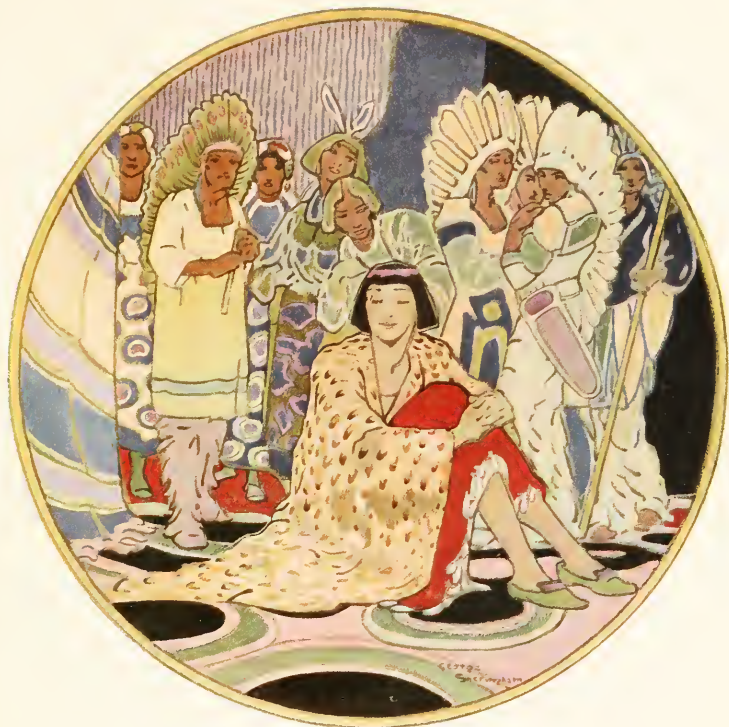
THE PEOPLE WERE ALL GATHERED FOR THE WEDDING