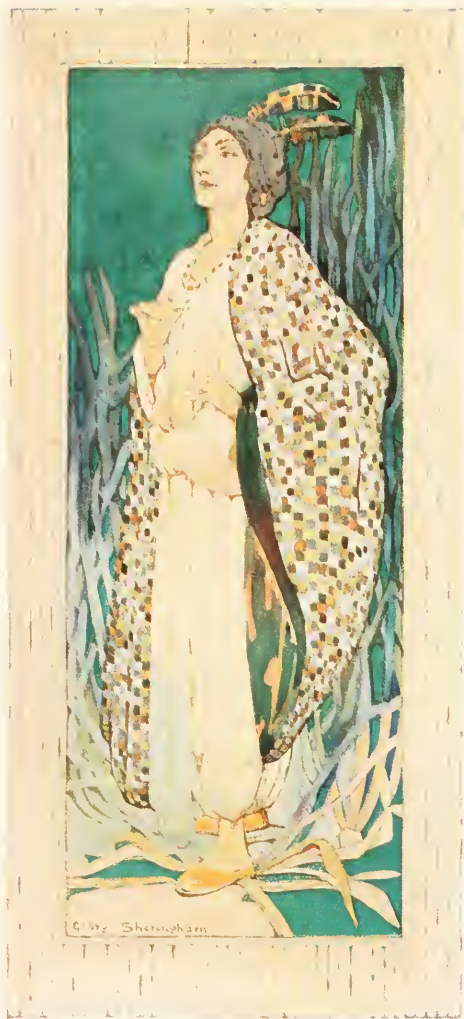
THE CHIEF HAD A BEAUTIFUL DAUGHTER.