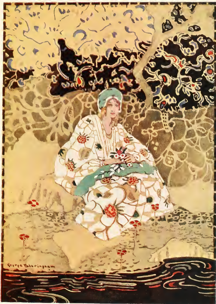
A VERY BEAUTIFUL GIRL SITTING ON THE BANK OF THE STREAM.