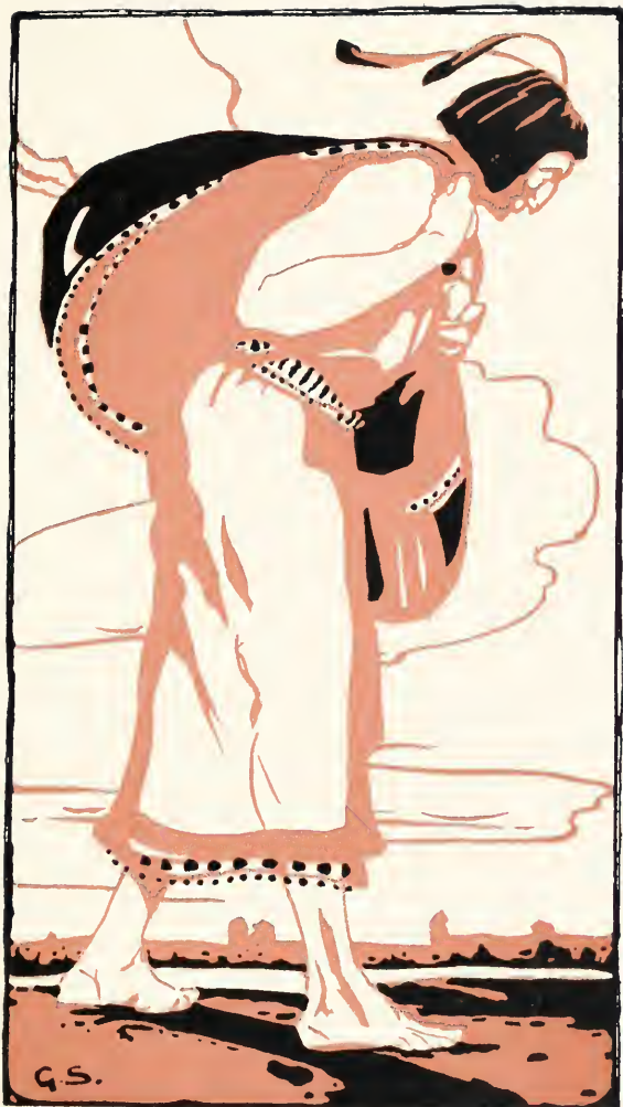
HE CAME SUDDENLY UPON A WIDE AND OPEN RED PLAIN