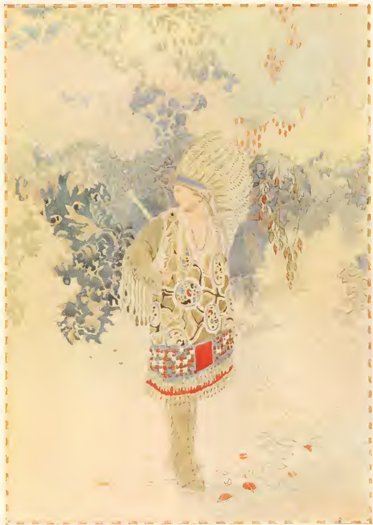
GLOSKAP WALKED ALONE BY THE OCEAN