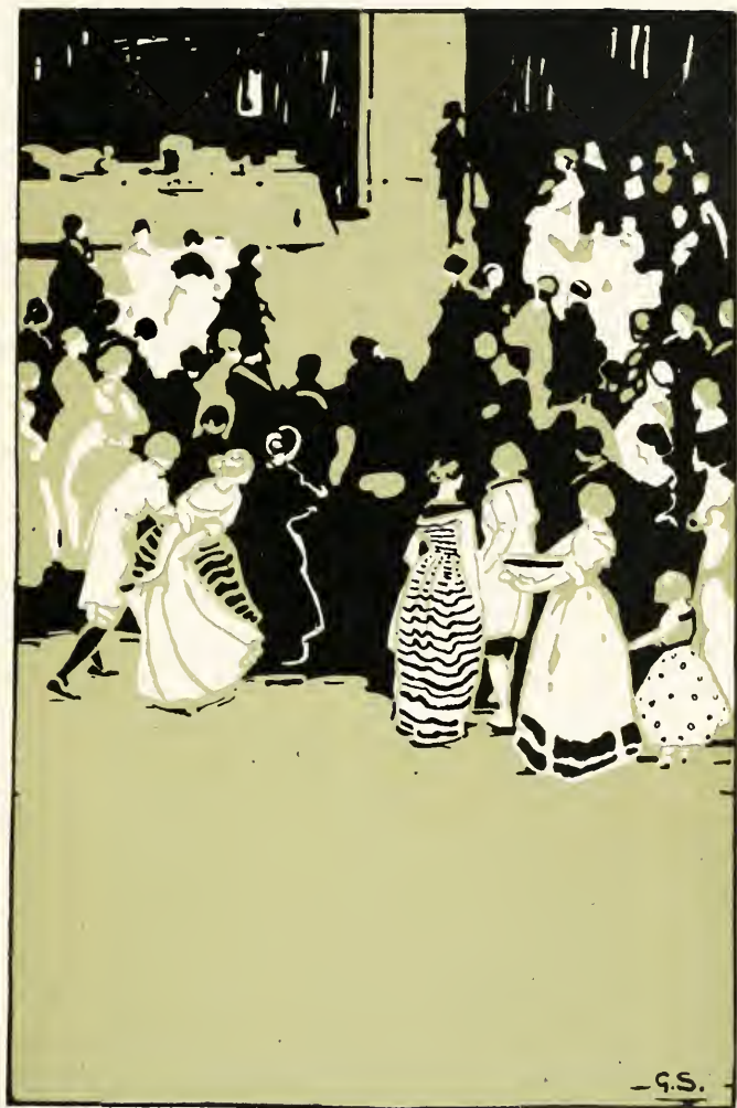
THE NIGHT WAS ALWAYS ONE OF GREAT MERRIMENT AND FEASTING.