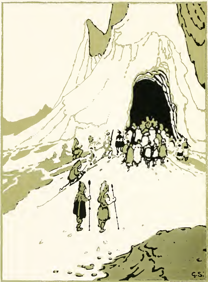
THE PEOPLE SET OUT TO FIND THE GIANTS. SOON THEY CAME TO THEIR CAVE.