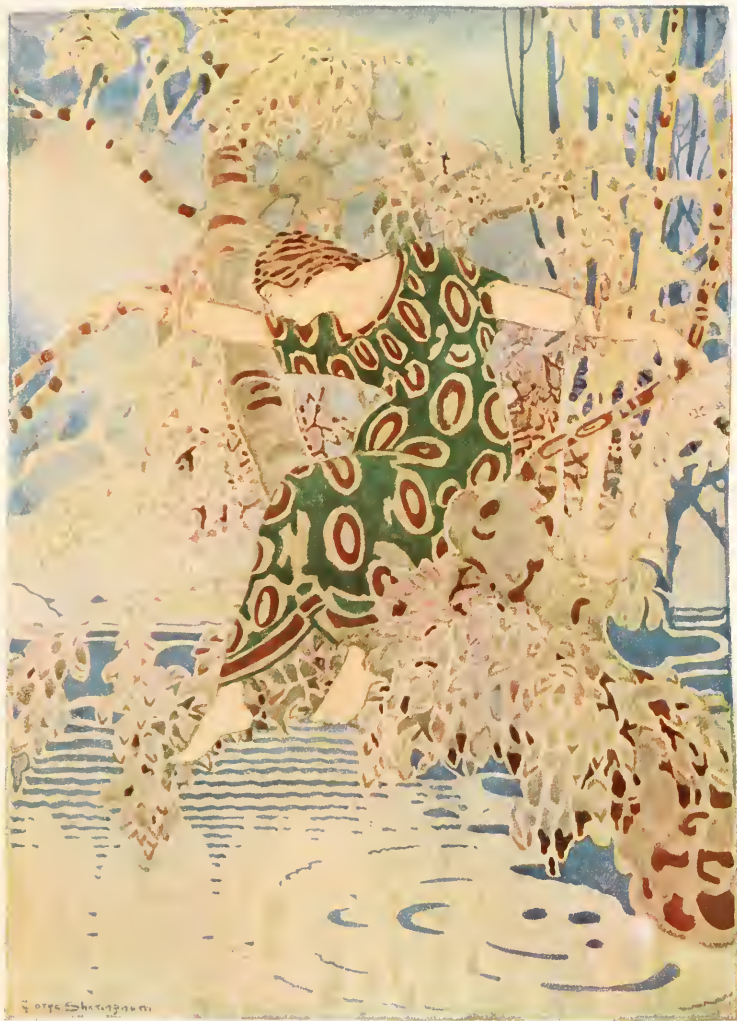
SHE CLIMBED INTO A TREE THAT STRETCHED OUT OVER THE WATER