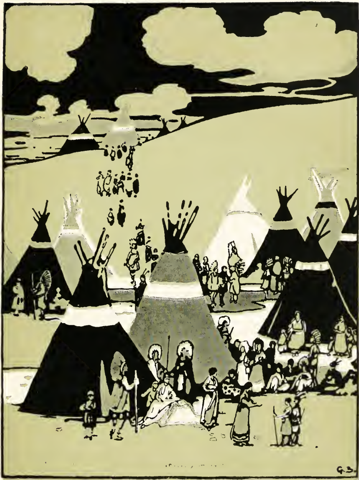
IN THE EVENING THEY CAME TO A CAMP.