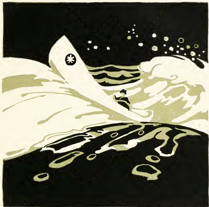
THE LITTLE MAN WEATHERS THE STORM IN GLOOSKAP'S HEAVY CANOE.