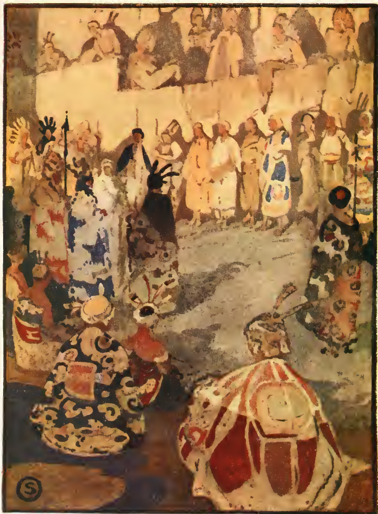
THE GREAT COURT TENT WAS FILLED WITH GLOOSKAP'S PEOPLE FOR THE SUN'S TRIAL.