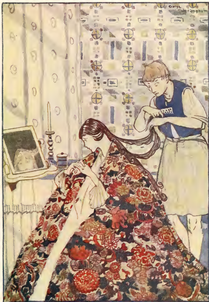
THEN HE DRESSED HIS SISTER IN GOOD CLOTHES AND WASHED AND COMBED HER HAIR