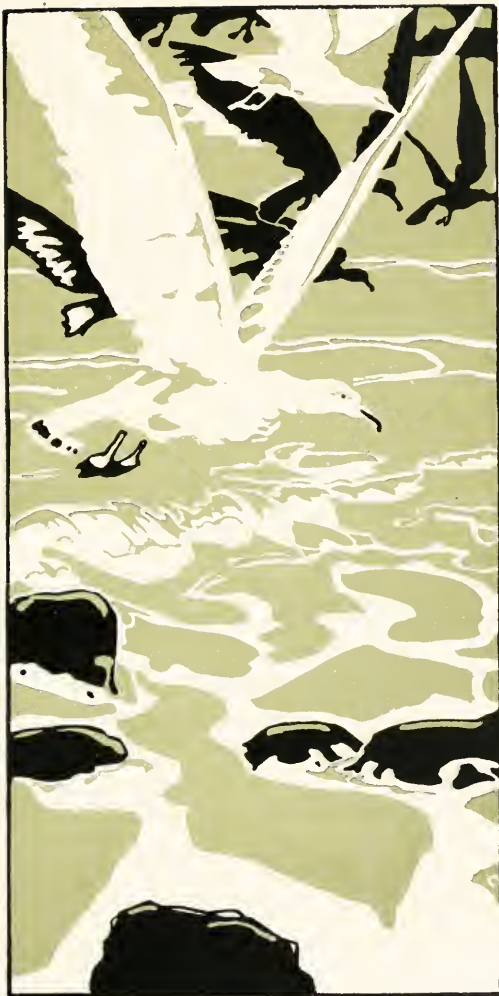
FROM THE BEACH CAME A LARGE WHITE SEA GULL.