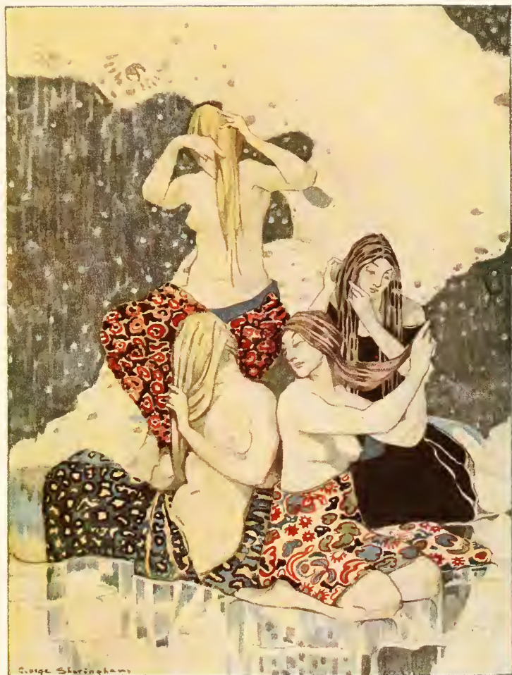
HE SAW FOUR BEAUTIFUL MAIDENS SITTING ON THE ICE BRAIDING THEIR HAIR.