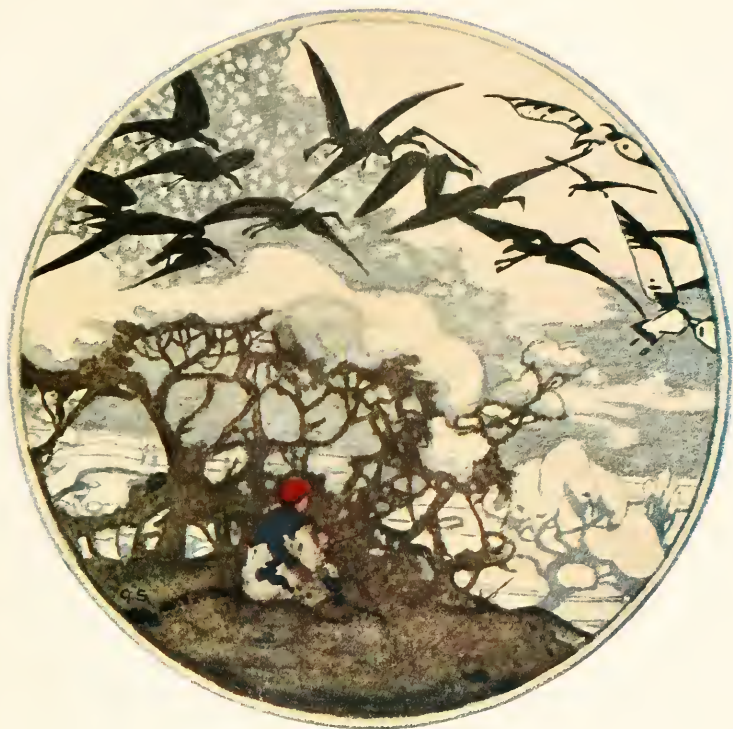
THE SNOW LAY DEEP ON THE FLAINS, AND MANY ENCW BIRDS WERE FLYING AROUND LOOKING FOR FCCD.