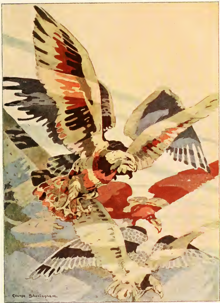
THE GREAT EAGLE MADE THE WINDS FOR HIM