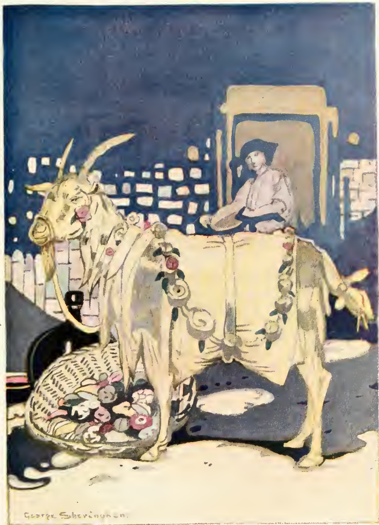
HE BOUGHT A LARGE QUANTITY OF FOOD, PUT IT IN A BASKET, AND CARRIED IT TO THE ANIMAL YARD.