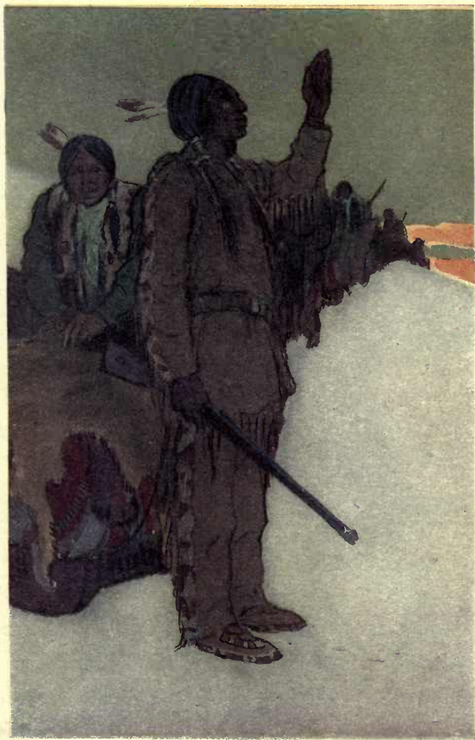
INDIAN TRAPPERS COMING IN WITH FURS