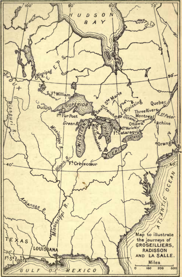
Map to illustrate the journeys of GROSEILLIERS, RADISSON AND LA SALLE.