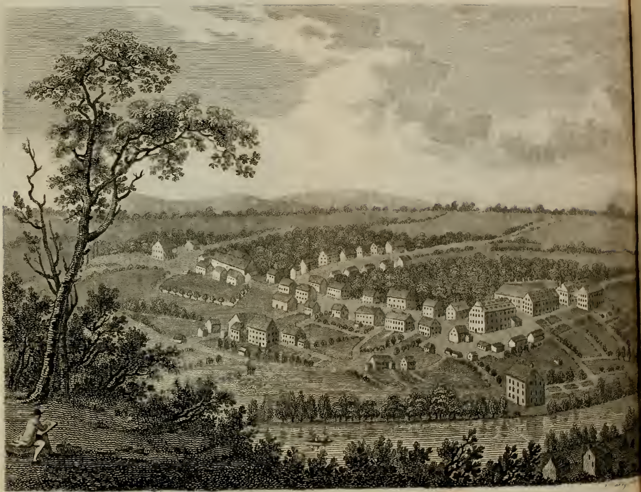
VIEW of BETHLEHEM a Meruvian settlement