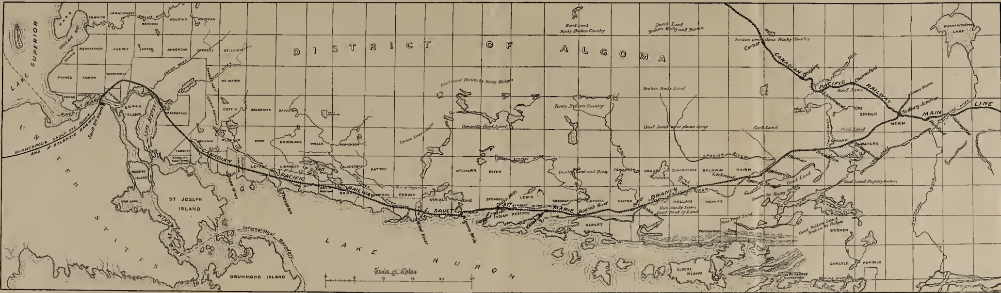
MAP OF THE SAULT STE. MARIE BRANCH OF THE CANADIAN PACIFIC RAILWAY AND THE ADJACENT COUNTRY.

Reduced-rate second-class tickets to Algoma District, both single and return, are issued to bona fide intending settlers from any station on the Canadian Pacific Railway east of Smith's Falls. In order to procure these reduced-rate tickets, application must be made to the Colonization Agent of the Canadian Pacific Railway, 288 St. James Street, Montreal.