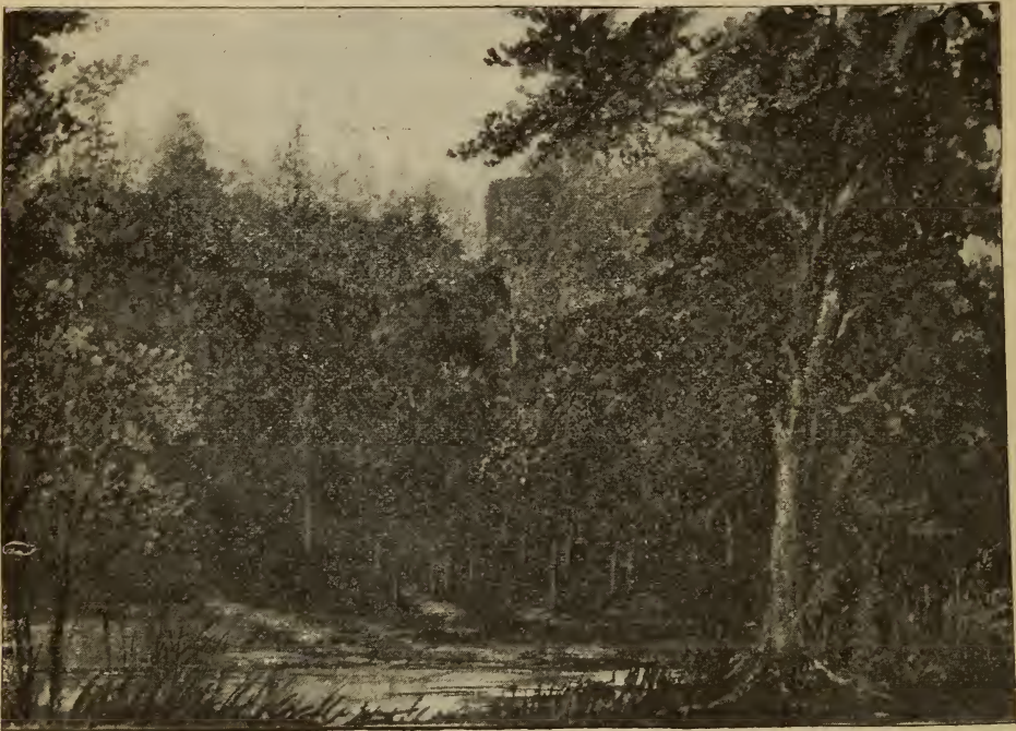
DON VALLEY—CASTLE FRANK IN THE DISTANCE.

This phraseology was in harmony with the fashion of the times prevailing among gentlemen, in and out of Parliament, who had, most of them, been classically trained. Had Sir Joseph Banks or any other gentleman of this character chanced to have seen the Governor at Navy Hall, standing up in the presence of an Indian Council, or it may be even of a Parliament,