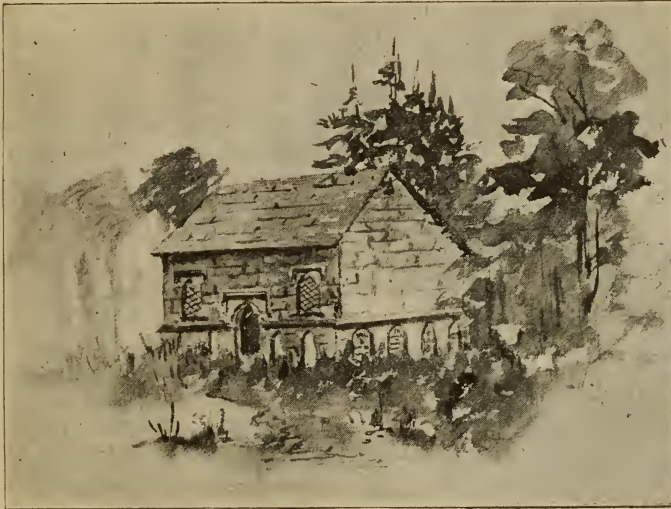
SIMCOE CHAPEL, ENGLAND.

Out of the middle point of the roof arose a massive chimney containing several flues. It may a once be said that the building was never thoroughly completed or occupied, and was never intended to be in any sense an official residence or anything more than