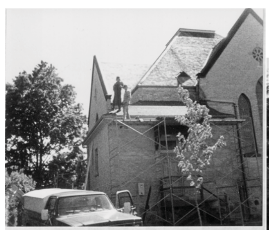
Right – shingles again in 1995