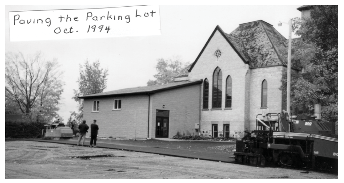
Paving the Parking Lot