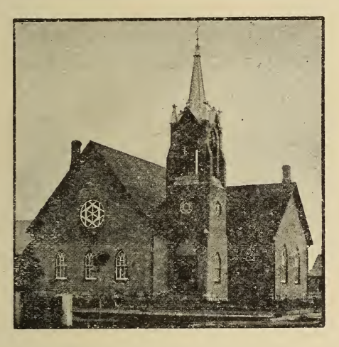
METHODIST CHURCH, KILLARNEY, MAN.

We have reached the critical period in our history. We are confronted with new rivalries, and grave problems, and the next ten years shall witness greater strides in development than any previous single decade. Political, social, and religious life is in need of godly men to touch every phase with the antiseptic salt of consecrated endeavor. This is the era of opportunity. The challenge of God