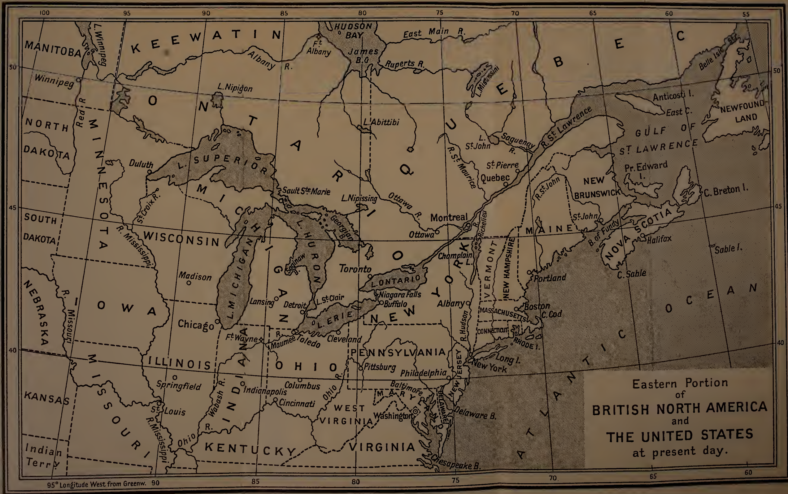
Eastern Portion of BRITISH NORTH AMERICA and THE UNITED STATES at present day.