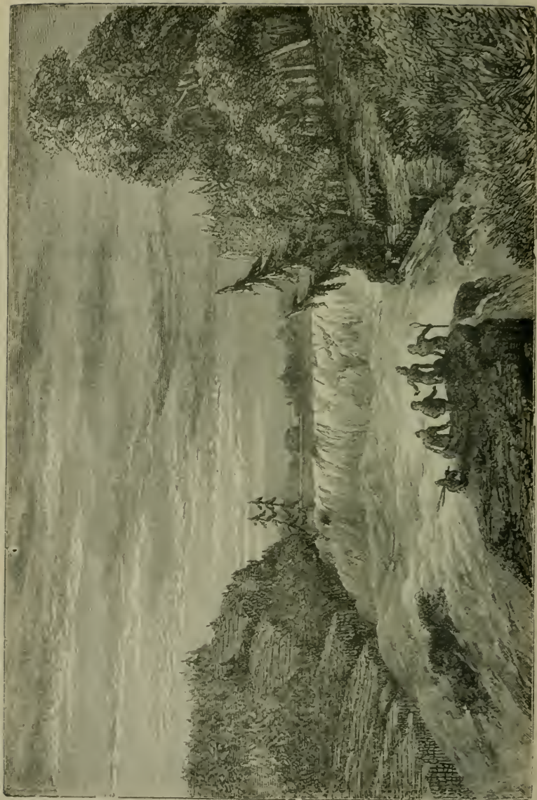
WORKING UP THE WINNIPEG.