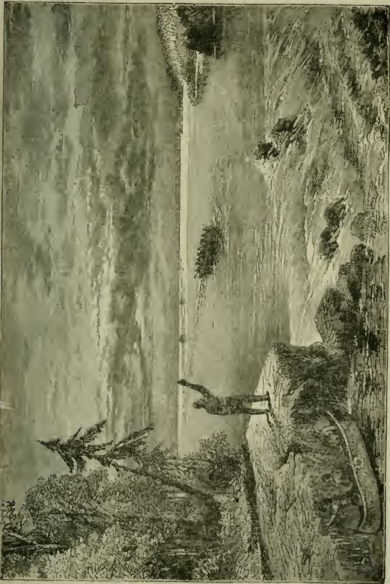
"WE PUT INTO THE ROCKY SHORE, AND, MOUNTING UPON A CRAG WHICH GUARDED THE HEAD OF THE RAPID, I WAVED TO THE LEADING CANOE AS IT SWEEP ALONG."