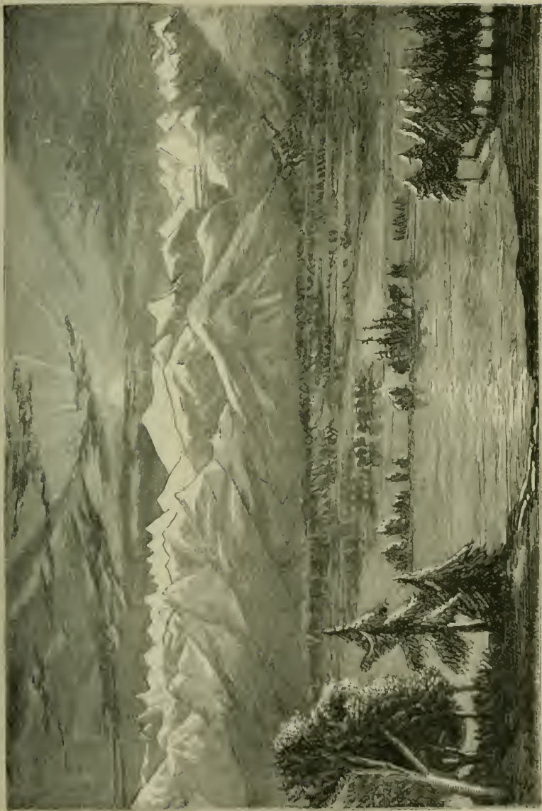
THE ROCKY MOUNTAINS AT THE SOURCES OF THE SASKATCHEWAN.