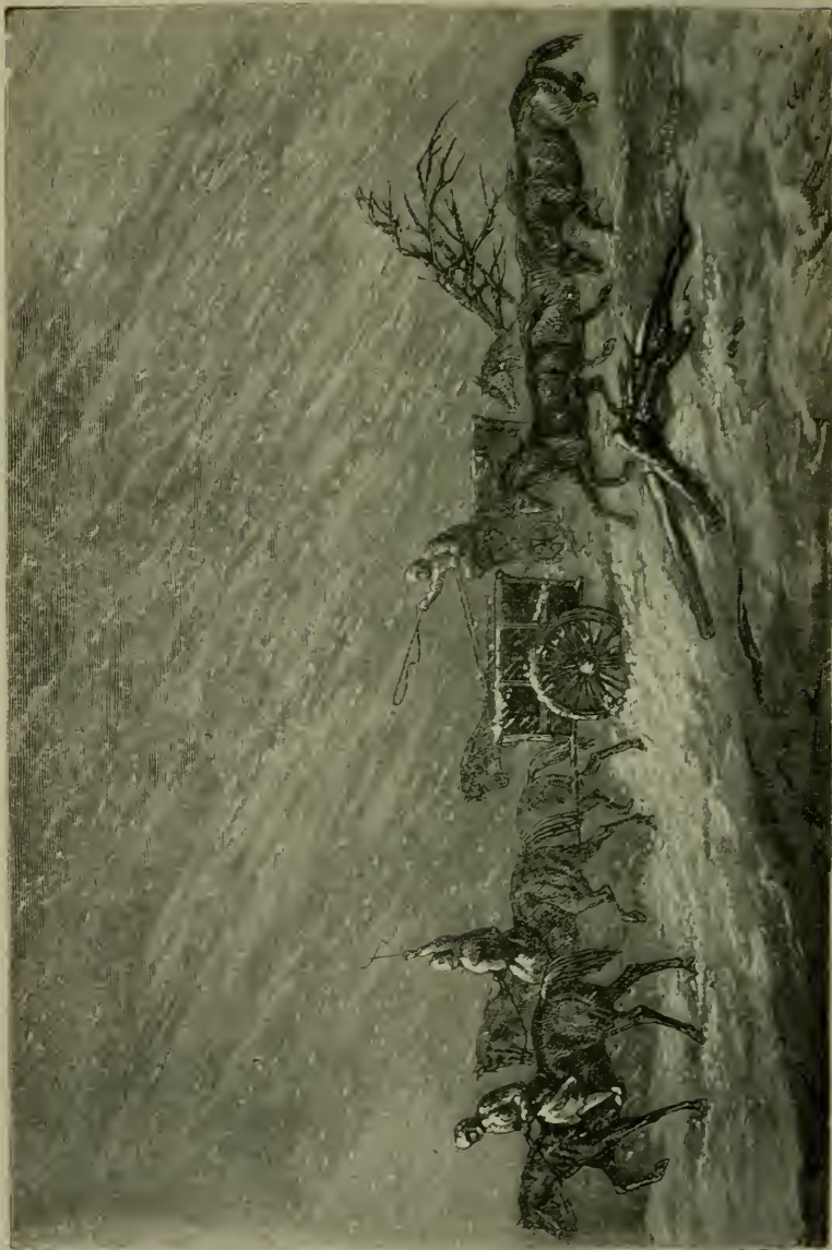
ACRO 8 THE PLAINS IN NOVEMBER.