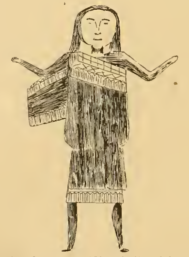
Fig. 4. Indian Dancing Costume. (Fac-simile of drawing by Shanandithit.)

Cartwright's idea that these were amulets has occurred to others. It was the view of a Micmac to whom the pendants from Rencontre were shown. He at once proclaimed the owner a great "witch," and able with such articles to strike his enemy dead. But it is plain that those in the boy's grave had been attached to the border of his robe, and seemed intended for ornaments. This is confirmed by the fact that Shanandithit has drawn a picture of a dancer as in his robe with such ornaments around its lower edge. (See fig. 4.) We cannot suppose that this was their ordinary every-day dress, but