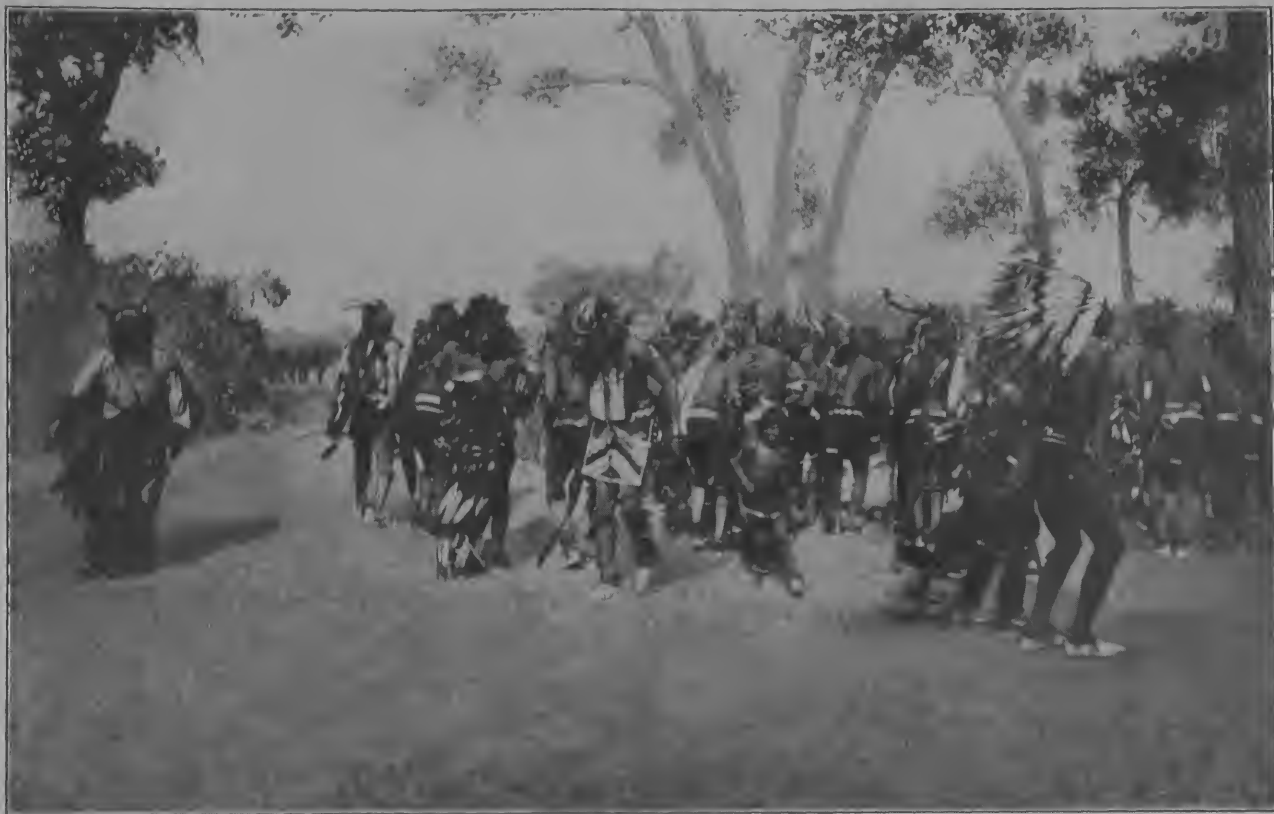
CROWS DANCING THE OMAHA OR GRASS DANCE