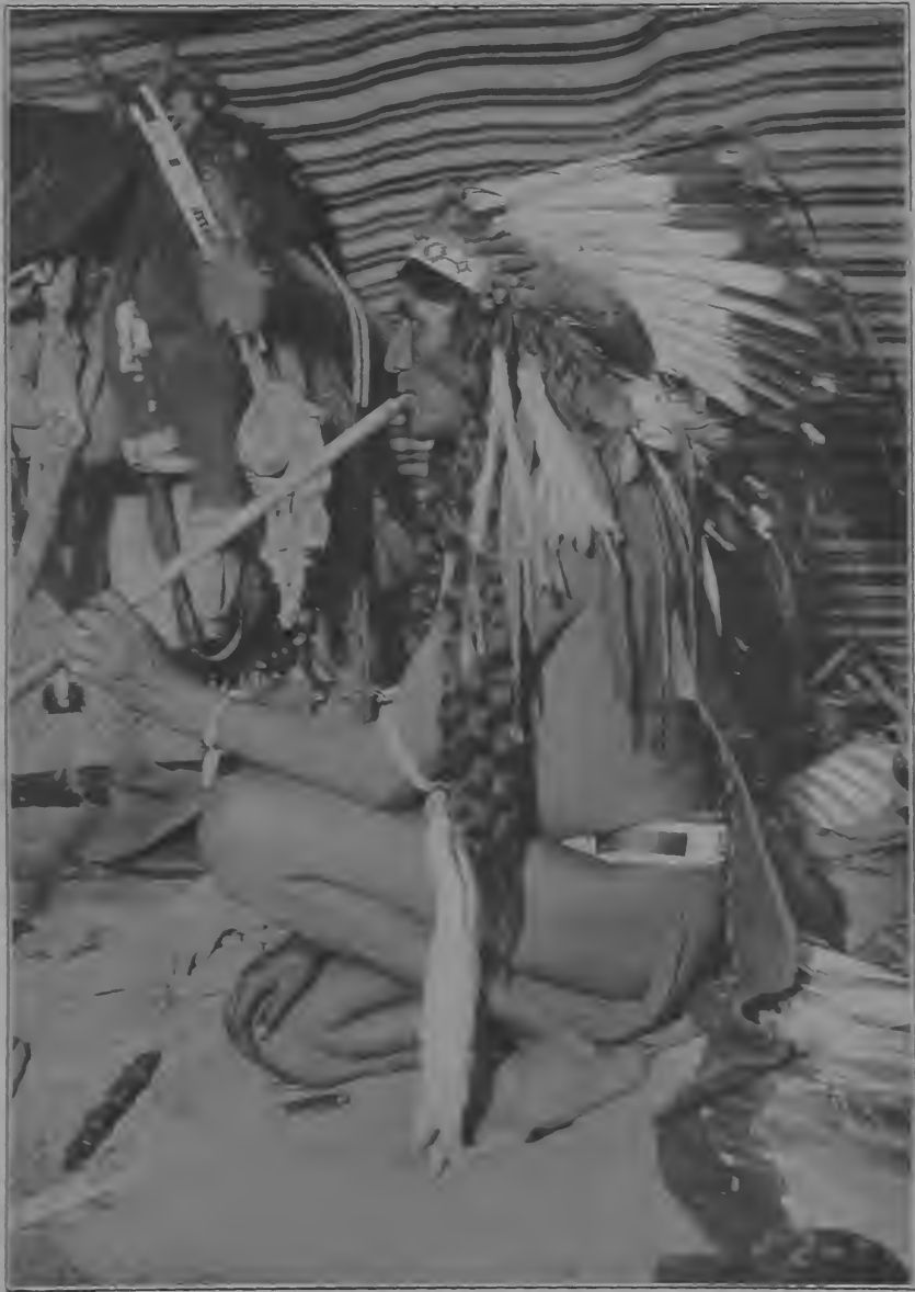
AN UNTAMED INDIAN