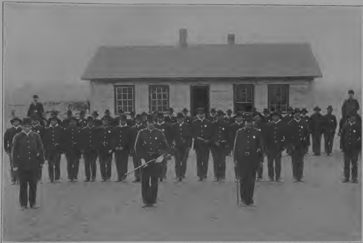
THE STANDING ROCK INDIAN POLICE, SURVIVORS OF THE SITING BULL FIGHT

Taken five days after the death of Sitting Bull. Major McLaughlin is seen mounted in the left background