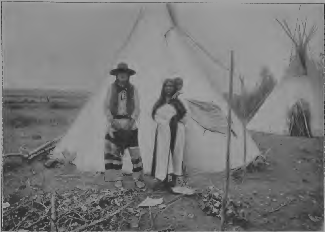
CURLY, A SURVIVOR OF THE CUSTER COMMAND IN THE LITTLE BIG HORN FIGHT, WITH HIS WIFE AND CHILD