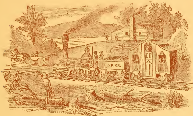
FIRST LOCOMOTIVE AND PASSENGER CAR IN THE WEST

"Erie and Kalamazoo. The engine, you can see, is named the 'Adrian No. 1,' and it was made by the Bald-