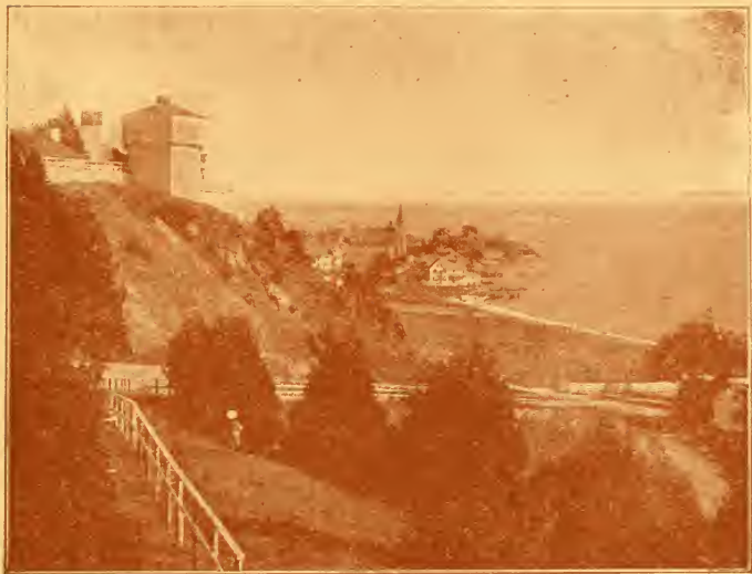
BLOCKHOUSE AT MACKINAC

"Although Henry escaped for the time, the Indians came back the next morning, said they had not found Henry's body among the slain, and therefore that he