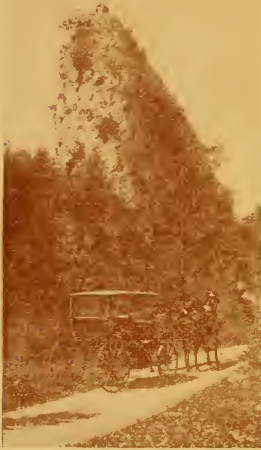
SUGARLOAF ROCK, MACKINAC ISLAND

“Well, Henry answered the Chippewas diplomatically, and gave them some presents, including at their special request a small keg of rum—‘the white man’s milk.’ He decided not to try to trade with them for the present, but spent a year or more in learning the Chippewa language. He also made friends with the Indians, with one chief in particular, a man named Wawatam.