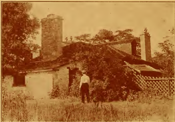
OFFICERS' QUARTERS, 1812, NEAR PENETANG

"Partly because the Iroquois made such a clean