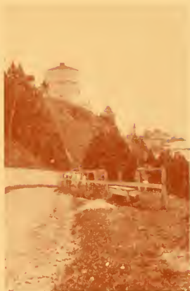
BLOCKHOUSE AT MACKINAC

"Because we are on Hay Lake, which is sixteen or eighteen miles long and several miles wide. It is a shallow lake, and the government has dredged out a channel through the middle of it. If it weren't carefully marked, vessels might stray out of it just far enough to run aground, and if a big cargo boat stuck its nose into the