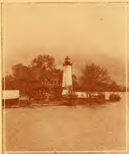
WINDMILL POINT, AT ENTRANCE OF DETROIT RIVER