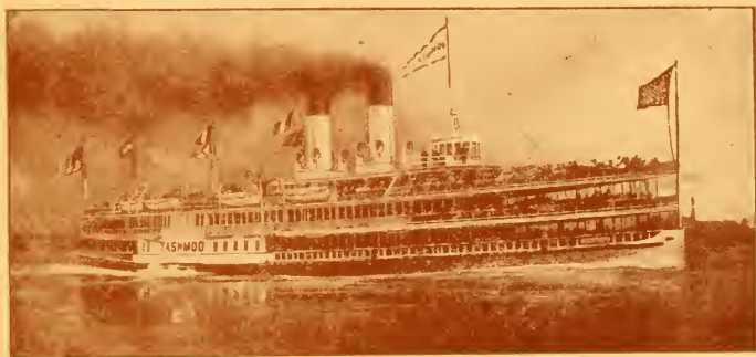
THE EXCURSION STEAMER "TASHMOO"

"You are right about that, James," said Major Woods. "The Indian names either recall the tribes who