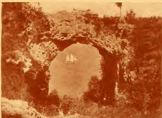
ARCH ROCK, MACKINAC ISLAND

especially on the lake. Each boat carried a crew of eight men, a thousand pounds of provisions, and sixty packages of freight weighing from ninety to a hundred pounds each. The freight was done up in small parcels because of the numerous portages on the way. Each