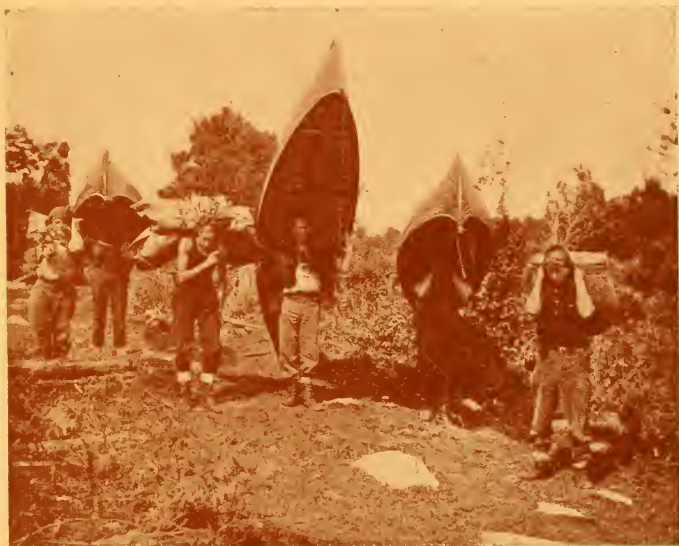
MAKING A PORTAGE

the marvelous. It was told to me by an Indian who was once my guide on a trip into the wilderness north of where we are now. We had finished a hard portage and were camped in the edge of the forest on a tiny sand-bank at the edge of a narrow, noisy little river. There