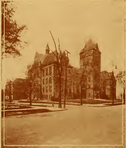
CENTRAL HIGH SCHOOL

"Detroit," he began, "has been the scene of a great deal of fighting. When the French first came, some of the Indians did not look with much favor on the white man's building a stockade which his red brothers were not free to enter at any time, so in 1706 the Ottawas besieged the fort