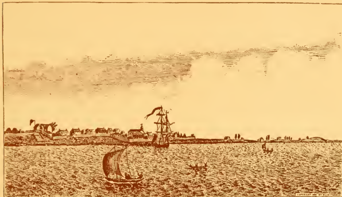
DETROIT IN 1796

“Oh, no. The fort which Pontiac besieged was on the site of the original Fort Ponchartrain, rebuilt and enlarged four or five times. Fort Wayne, which is over three miles down the river from Fort Detroit, wasn't built until 1851, nearly a hundred years later. In 1778