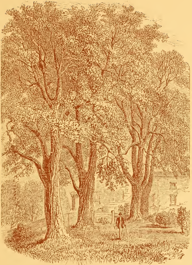
OLD PEAR TREES AT DETROIT. PHOTOGRAPHED IN 1883