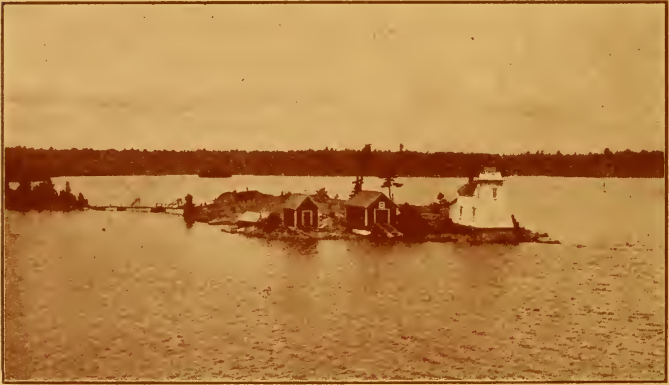
ENTRANCE TO WILSON CHANNEL

“Oh, dear, no. Don't you remember, for instance, where he tells about how the women blessed the corn-fields? Well, the Iroquois did that when the first white men saw them, and they may do it yet, for all I know. Longfellow actually invented very little of his poem; all he did was to arrange and turn into verse some of the Indian legends he had found.”