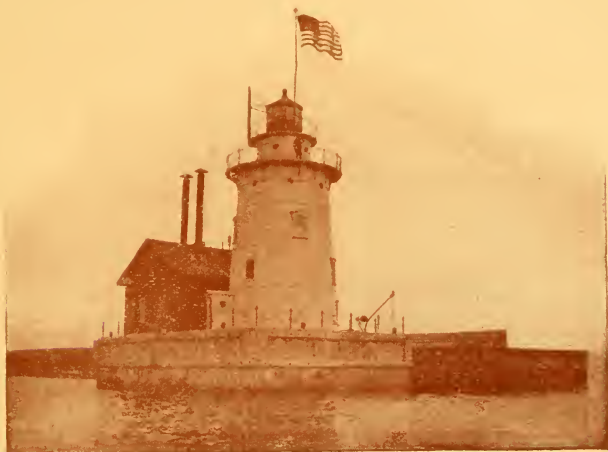
THE LIGHT AT HARBOR BEACH

The deckhands were still making the steamer fast to the dock when a chunky, red-faced young man in a blue suit jumped lightly aboard, made his way to the upper deck, and after looking around a minute came up, cap in hand, and asked: