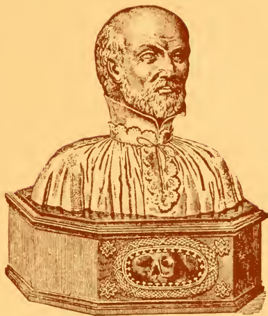
FATHER JEAN DE BRÉBEUF