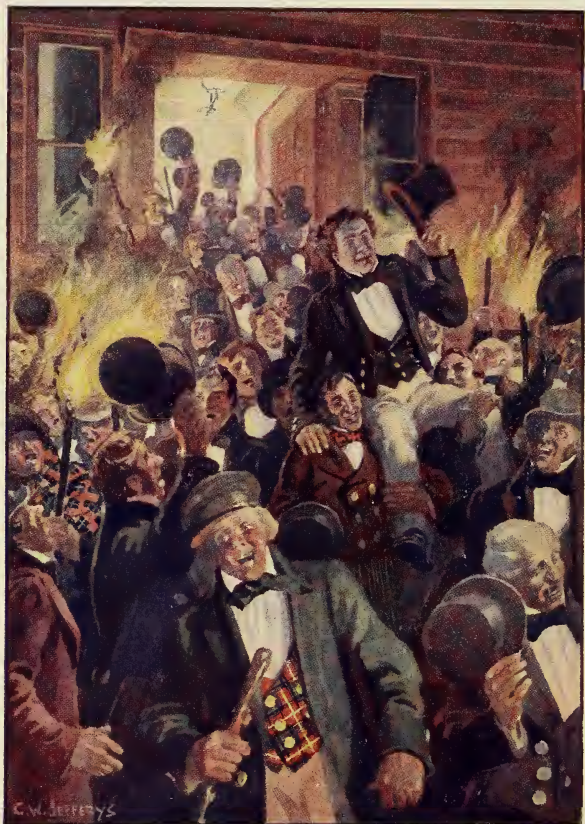
THE TRIBUNE OF NOVA SCOTIA—AFTER A SPEECH IN MASON HALL