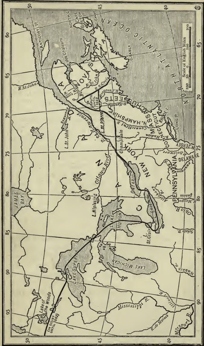
MAP SHOWING BOUNDARY BETWEEN CANADA AND THE UNITED STATES BY TREATY OF 1783.