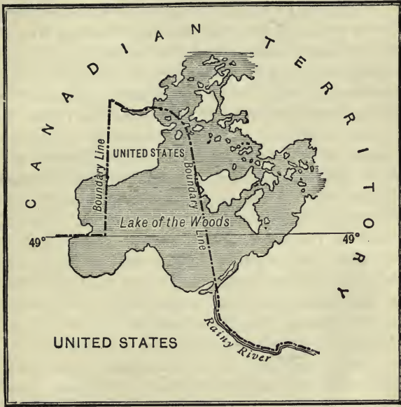
INTERNATIONAL BOUNDARY AS FINALLY ESTABLISHED IN 1842 AT LAKE OF THE WOODS.

west was only rectified in 1842, when Lord Ashburton settled the difficulty by conceding to the United States an invaluable corner of British territory in the east (see below, p. 299).