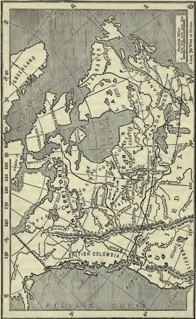
MAP OF BRITISH AMERICA TO ILLUSTRATE THE CHARTER OF THE HUDSON'S BAY COMPANY.