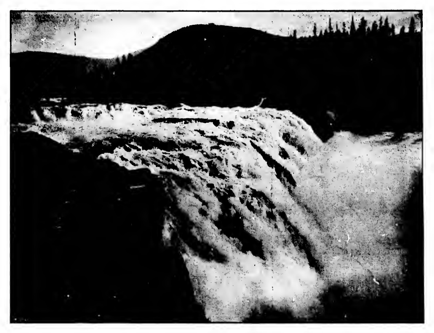
LOWER FALLS, KOOTENAY RIVER.