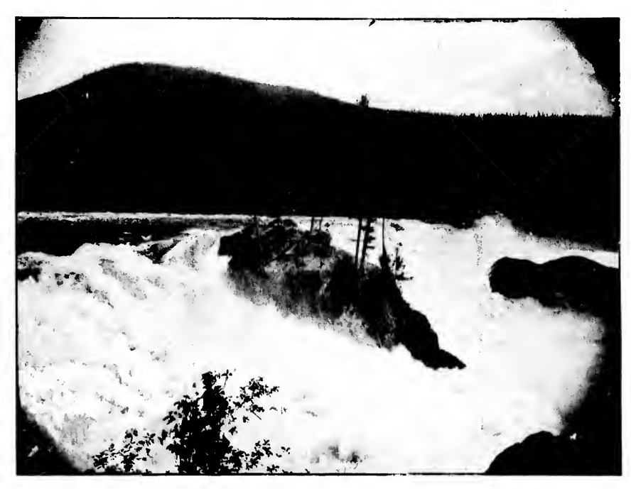
UPPER FALLS, KOOTENAY RIVER.