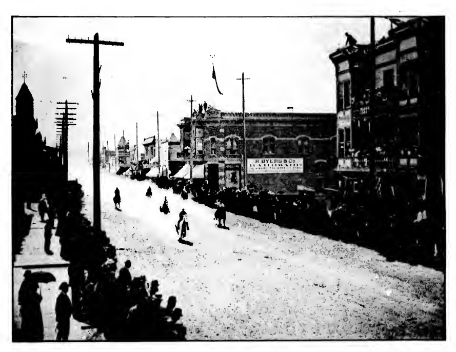
IST JULY SPORT, BAKER ST., NELSON, B.C., 1898.