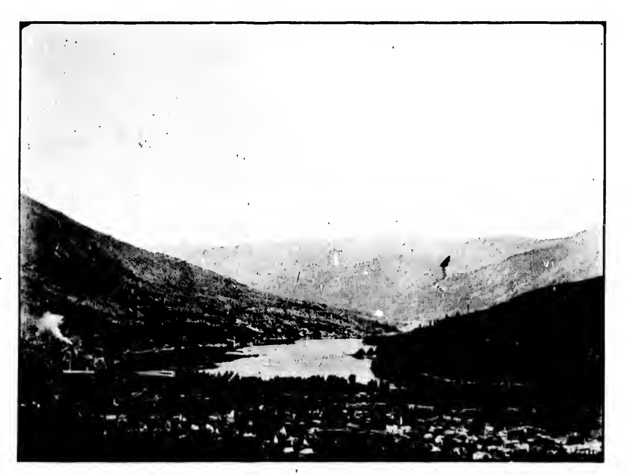
VIEW FROM NELSON, LOOKING DOWN KOOTENAY RIVER.