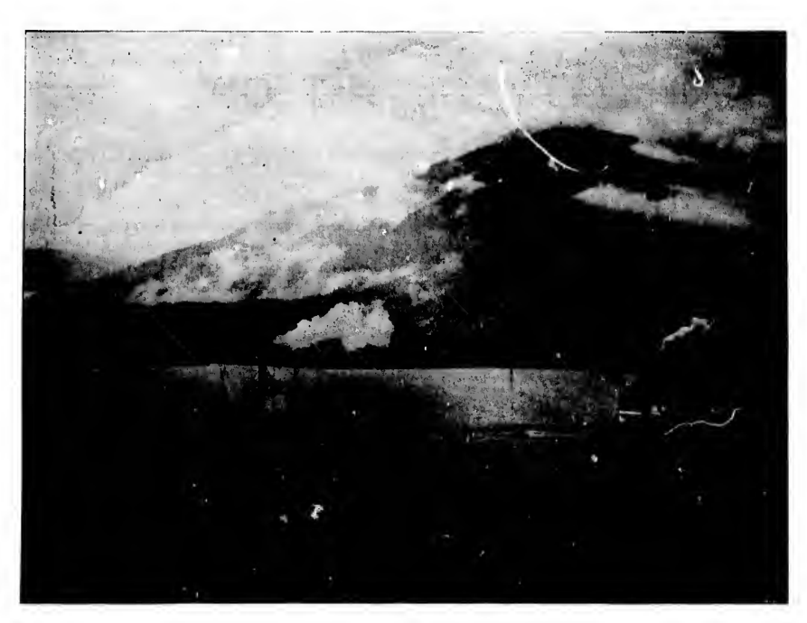
LAUNCHING STEAMER MOVIE, AT NELSON, 1898.