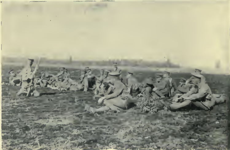
KITCHENS, 90TH RIFLES (8TH BATTALION)—VALCARTIER.