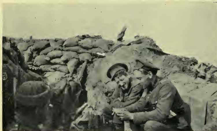
NEWS FROM HOME—AT THE