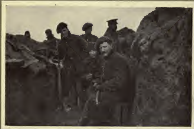
IN THE TRENCHES—AT THE FRONT.