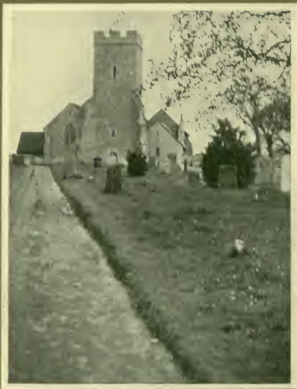
ST. MARTIN'S CHURCH—SHORNCLIFFE