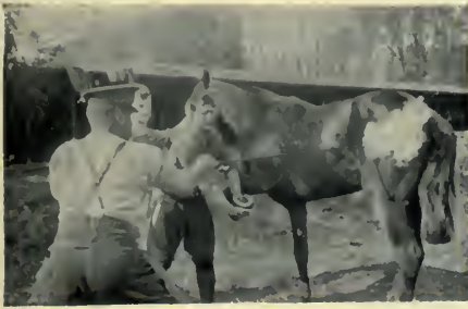
BRANDING HORSE WITH R.C.H.A. —MARESFIELD, SUSSEX.