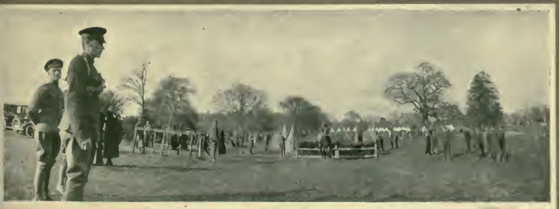
CANADIAN CAVALRY BRIGADE SPORTS— MARSHFIELD, SUSSEX.