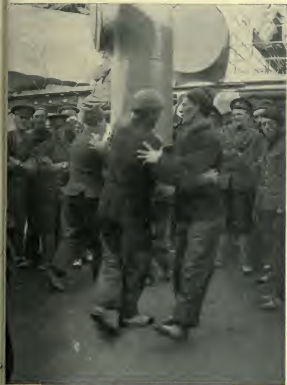
AT SEA—THE DANCE.