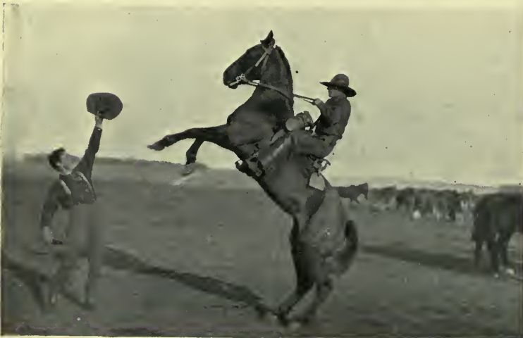
ONE OF THE REMOUNTS—SALISBU PLAIN.