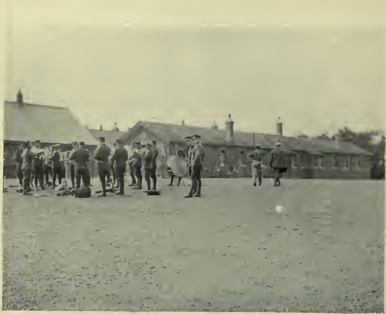
BAND OF 11TH BATTALION AT MOORE BARRACKS HOSPITAL.