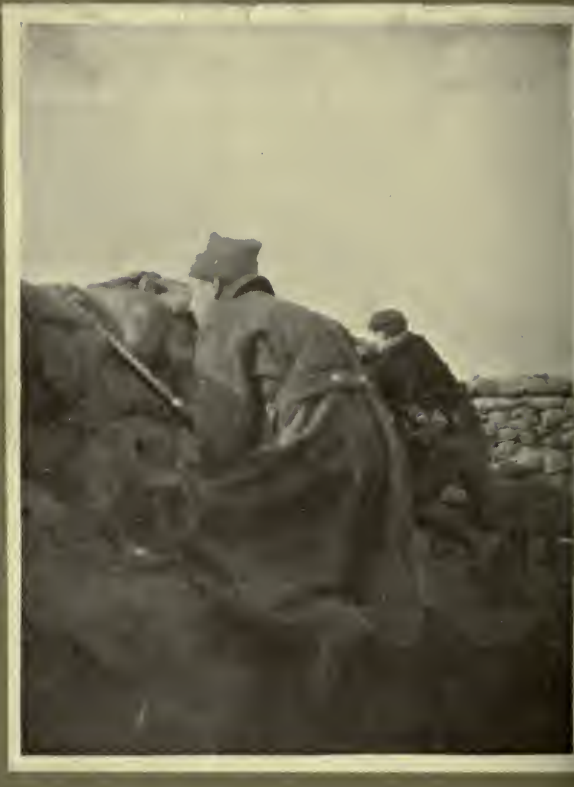
WATCHING FOR THEM—AT THE FRONT.