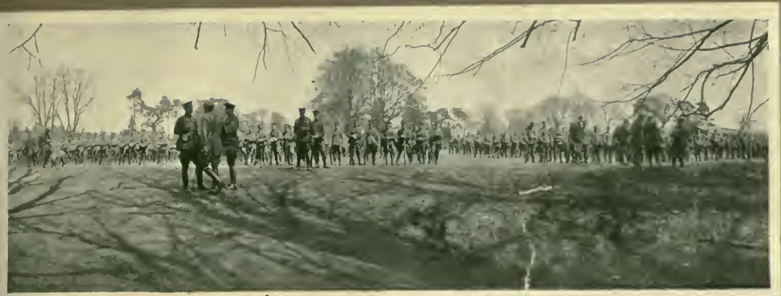
KING EDWARD HORSE, ROYAL CANADIAN DRAGOONS, AND LORD STRATHCONA HORSE—MARSHFIELD, SUSSEX.