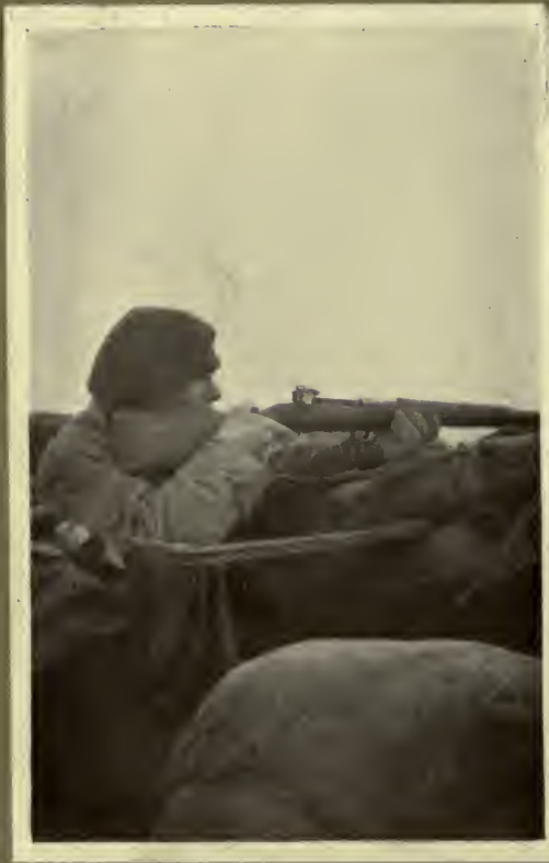
THE SNIPER—AT THE FRONT.