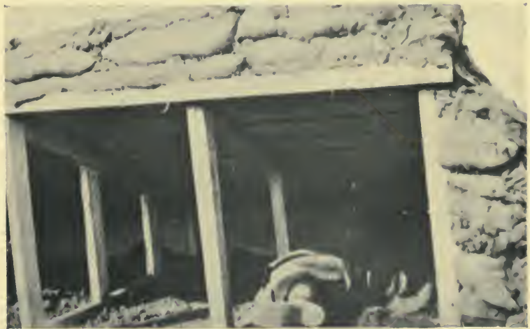
IN A DUGOUT—AT THE FRONT.