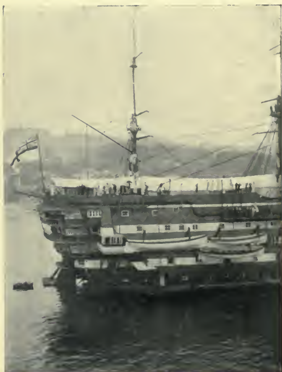
A WELCOME FROM THE TRAINING SHIP—PLYMOUTH.