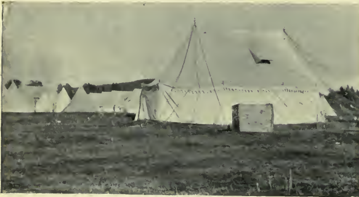
FIELD COMFORTS TENT— VALCARTIER.