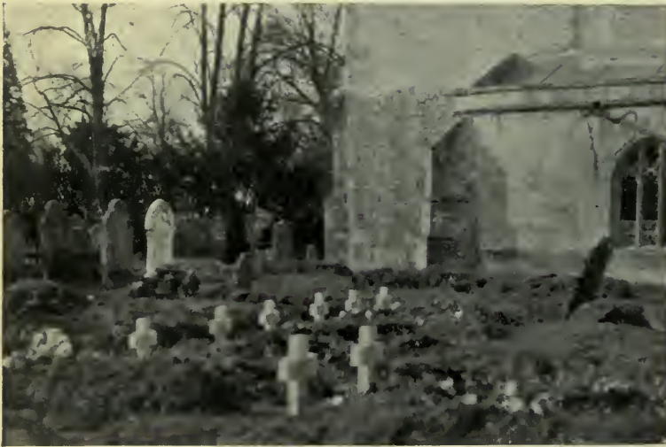
CHURCHYARD AT NETHERAV SALISBURY PLAIN.