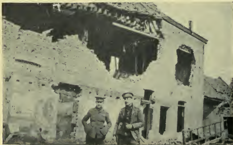
AFTER A JACK JOHNSON FRONT.