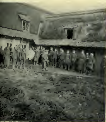
N BILLETS—AT THE FRONT.