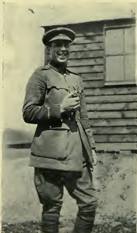
ARE WE DOWNHEARTED SALISBURY PLAIN.