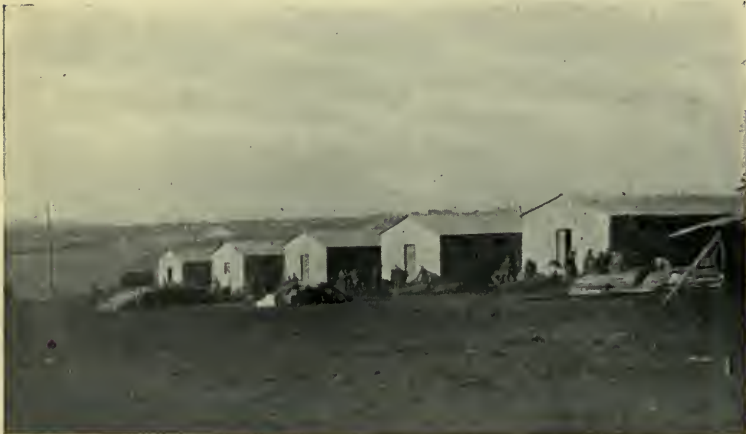
HUTS AT LARKHILL—SALISBU PLAIN.