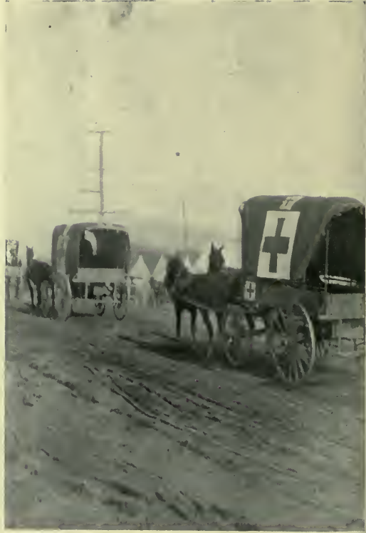
GOING TO THE REVIEW—VALCARTIER.