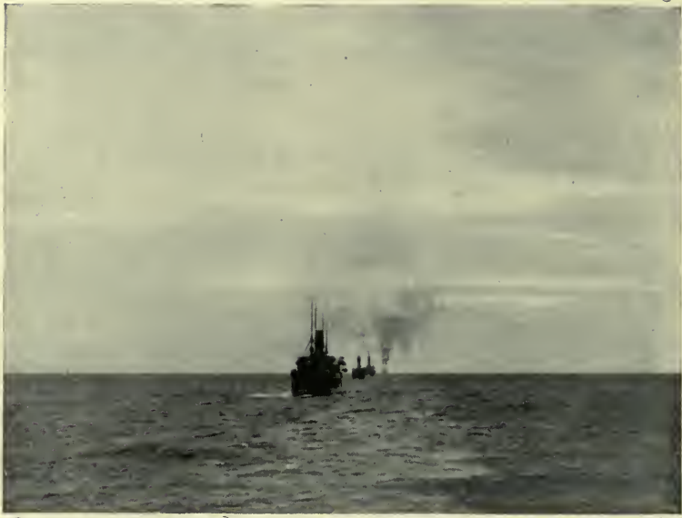
AT SEA—THE LINE ASTERN.