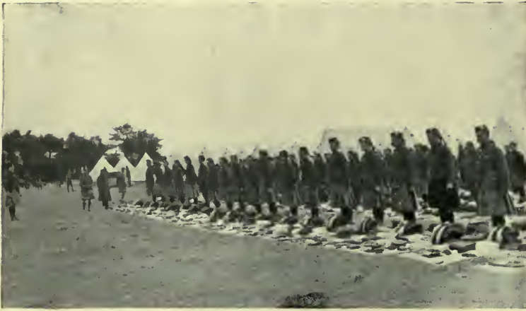
KIT INSPECTION, 48TH HIGHLAND (15TH BATTALION)—SALISBU PLAIN.