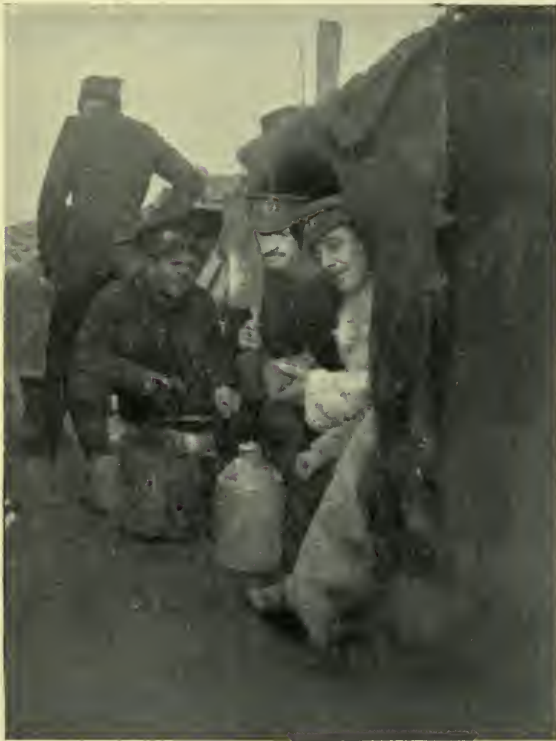
A HOME FROM HOME—AT THE FRONT.