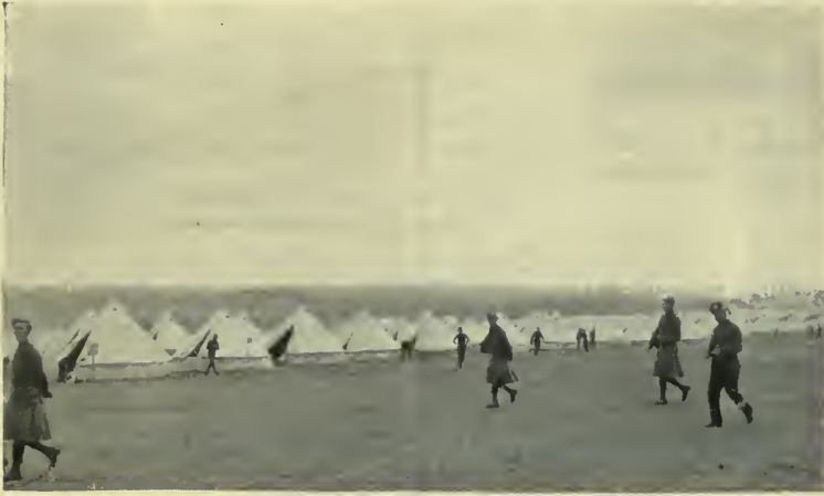
WEST DOWN SOUTH CAMP- SALISBURY, PLAIN.