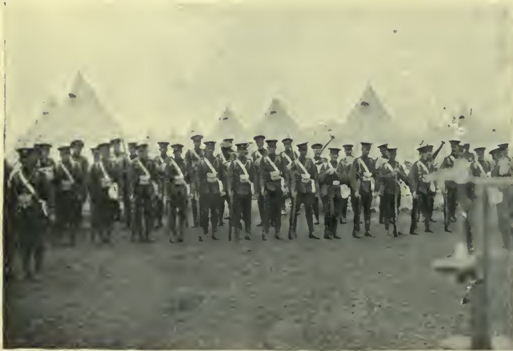
COBOURG MEN, 2ND BATTALION VALCARTIER.