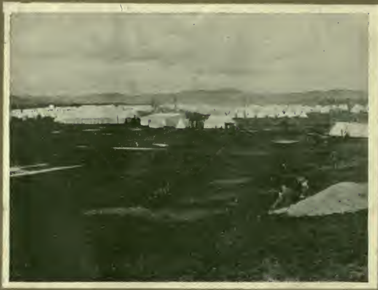
VIEW OF CAMP—VALCARTIER.