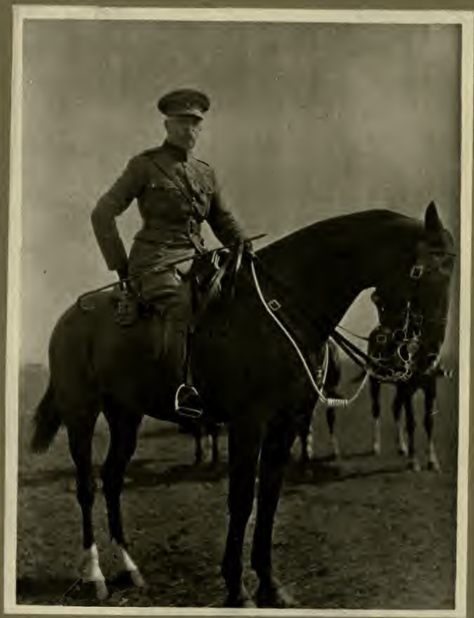
FIELD-MARSHAL H.R.H. THE DUKE OF CONNAUGHT, GOVERNOR-GENERAL OF CANADA.