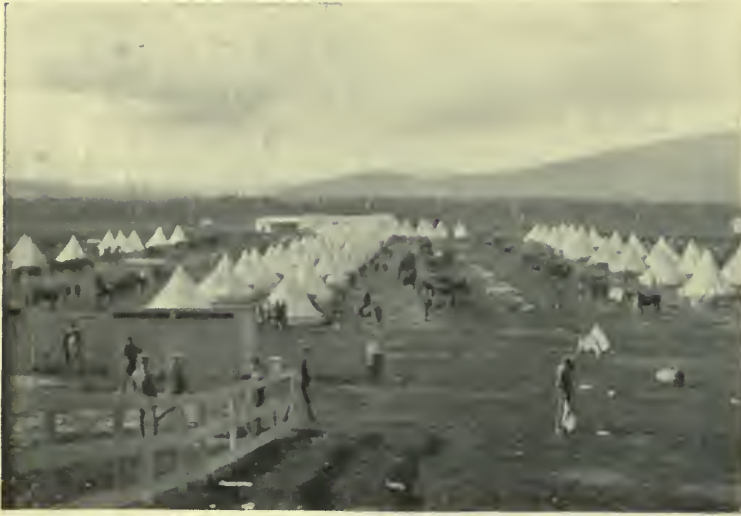
LORD STRATHCONA HORSE LINE VALCARTIER.