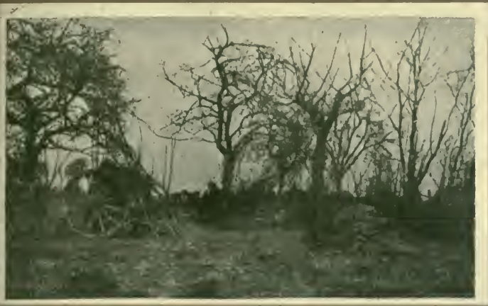
CANADIAN ARTILLERY—AT THE FRONT.