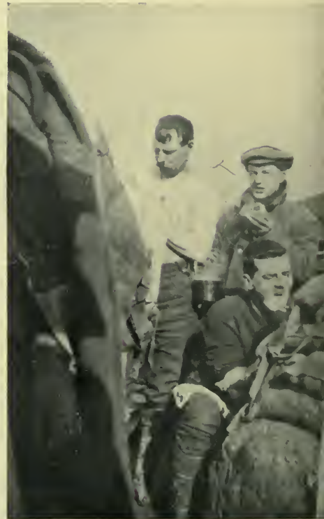
A TRENCH TOILET—AT THE FRONT.