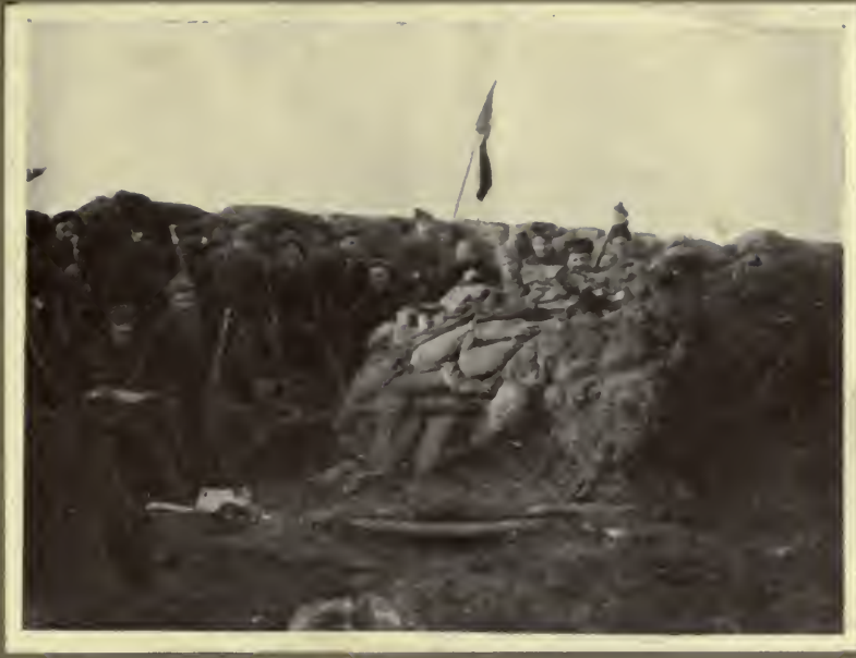
ST. PATRICK'S DAY—AT THE FRONT.