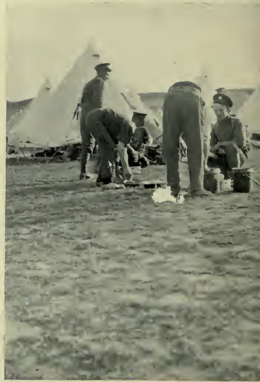
EVENING MEAL—DIBGATE CAMP.