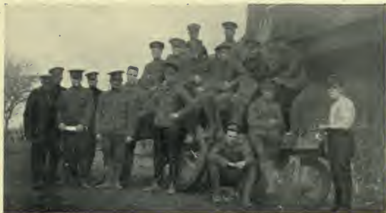
QUARTERS IN FRANCE—AT THE FRONT.