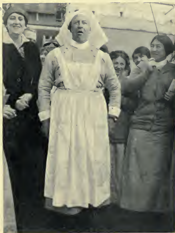
AT SEA—A NEW SISTER.