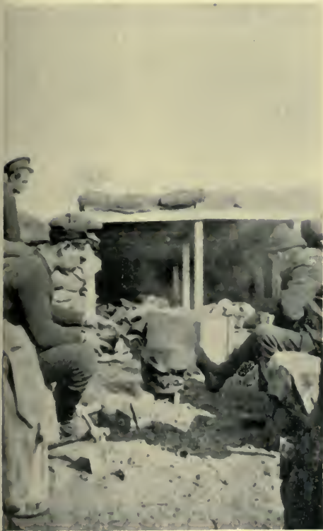
DINNER—AT THE FRONT.