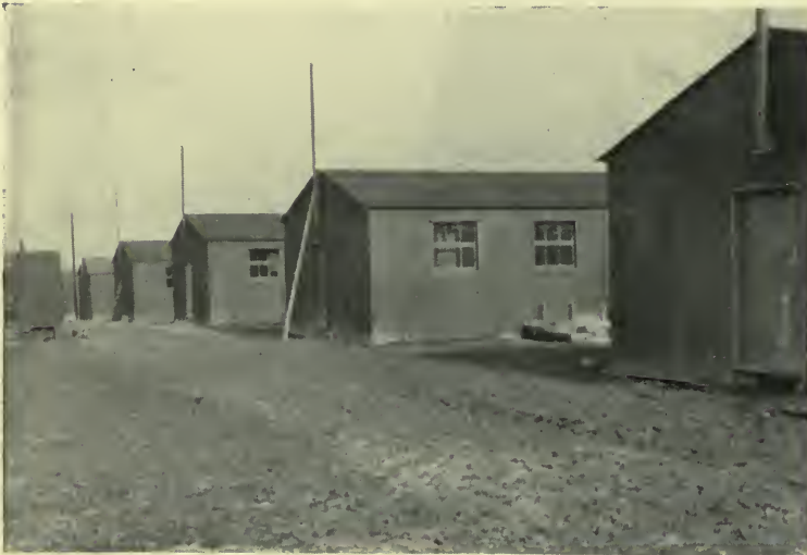
HUTS AT LARKHILL, CANADA SCOTTISH (16TH BATTALION)—SA BURY PLAIN.