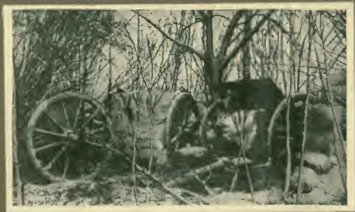
CANADIAN ARTILLERY—AT THE FRONT