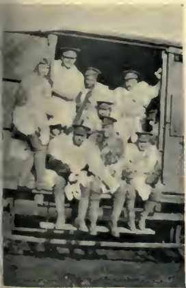
LOVELY WARM FUR COATS —AT THE FRONT.