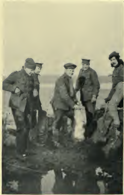
FILLING SANDBAGS—AT THE FRONT.