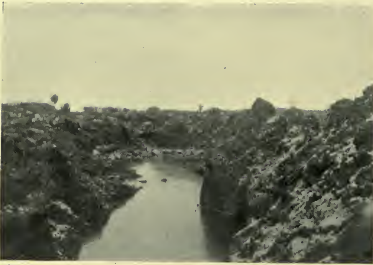
A DISUSED TRENCH—AT THE FRONT.