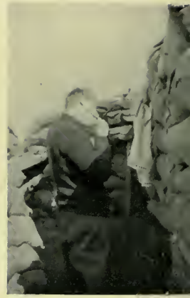
THE MORNING SHAVE— AT THE FRONT.