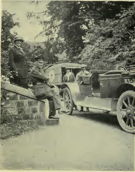
AT THE CONVALESCENT CAMP, MONK'S HORTON.