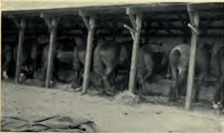
ROYAL CANADIAN DRAGOON HORSES—MARESFIELD, SUSSEX.