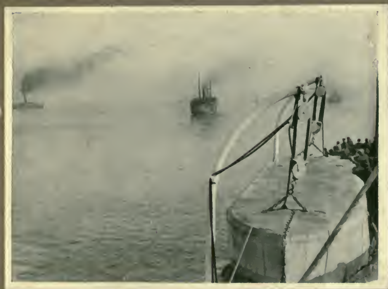
AT SEA—THE STAY.