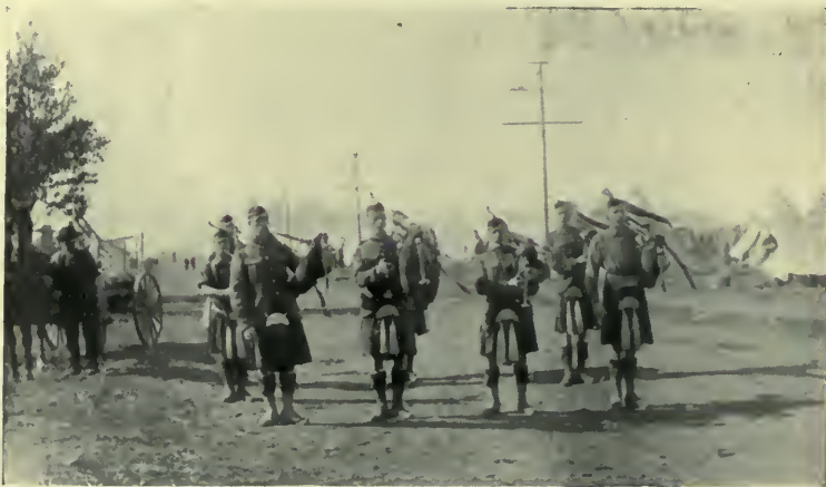
PIPES OUT FOR PRACTICE—VALCARTIER.