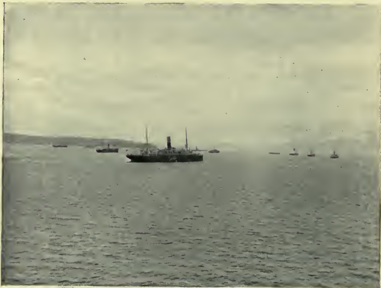
AT SEA—GASPÉ BASIN.