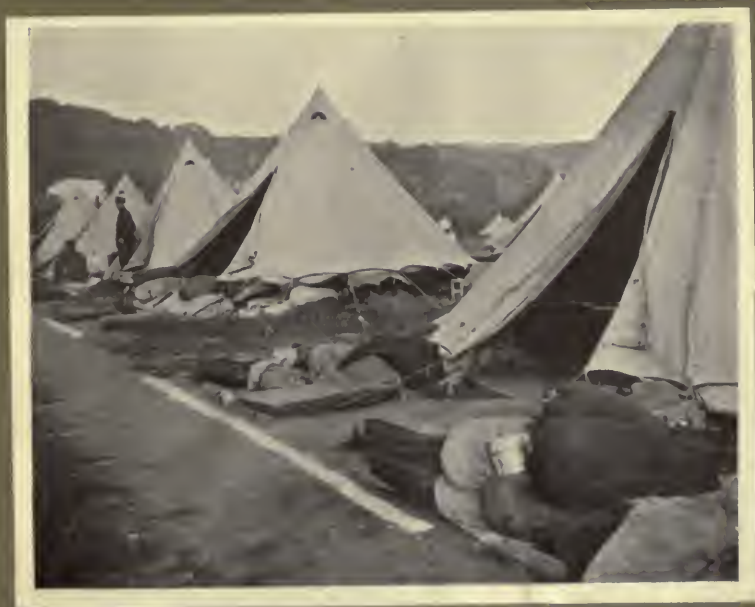
TENTS AT BIRGATE.