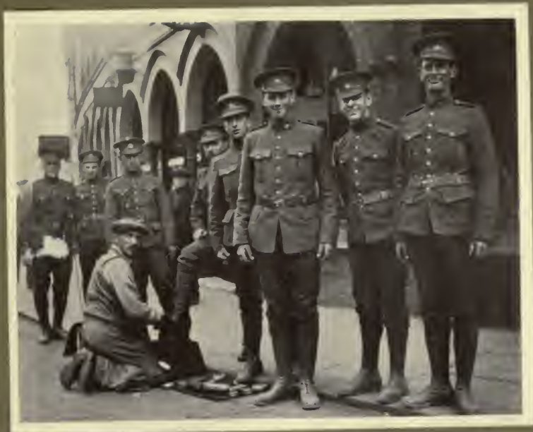
A STREET CORNER - FOLKSTONE.