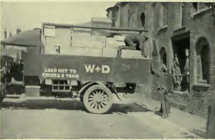
CANADIAN FIELD COMFORTS C SION—A TRUCKLOAD OF COM