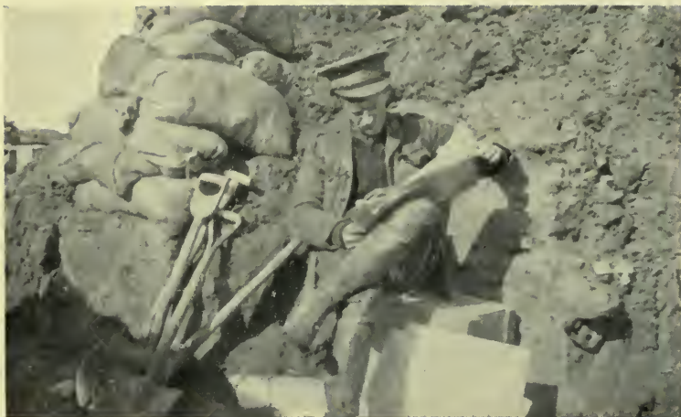
A QUIET READ—AT THE