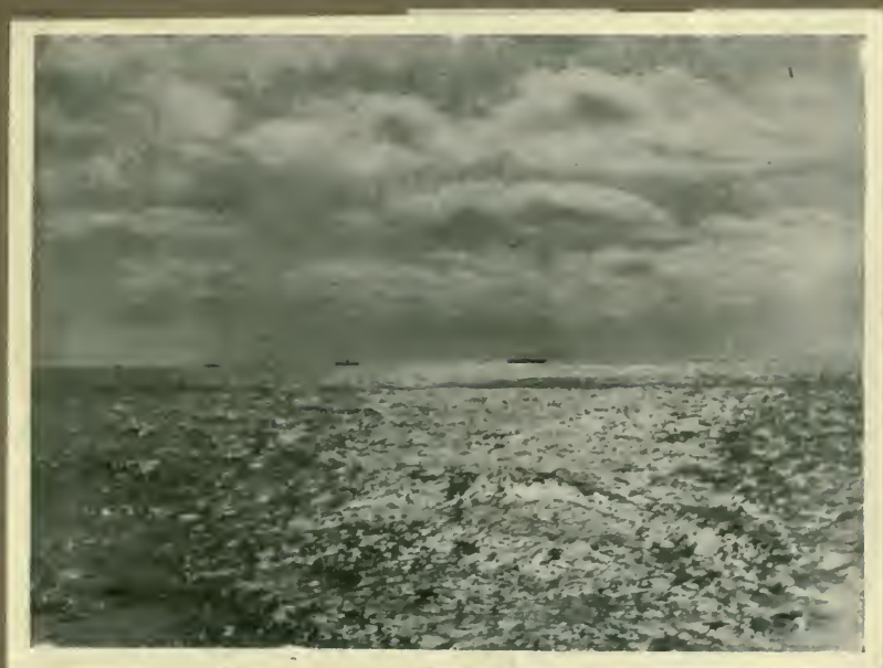
AT SEA—A FINE DAY.