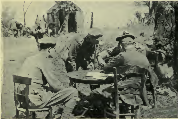
A CONSULTATION—AT THE F