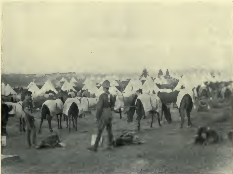
THE RANGES, 90TH RIFLES (8TH BATTALION)—VALCARTIER.