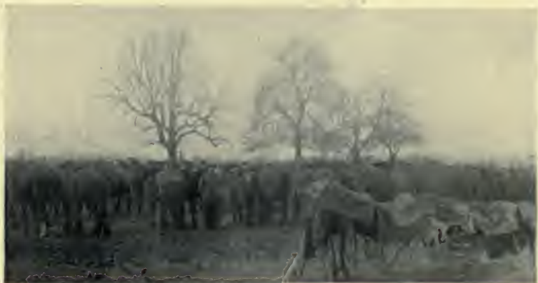
STABLES—AT THE FRONT.