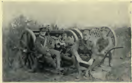
A GUN IN ACTION—MARESFIELD, SUSSEX.