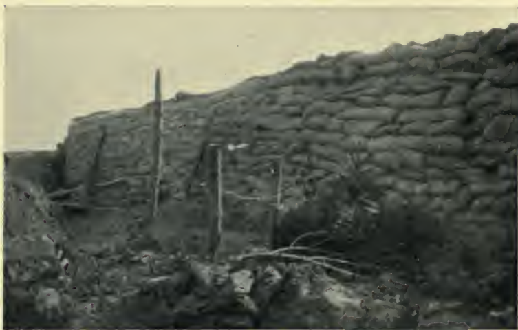
"SOME" SANDBAGS—AT THE FRONT.