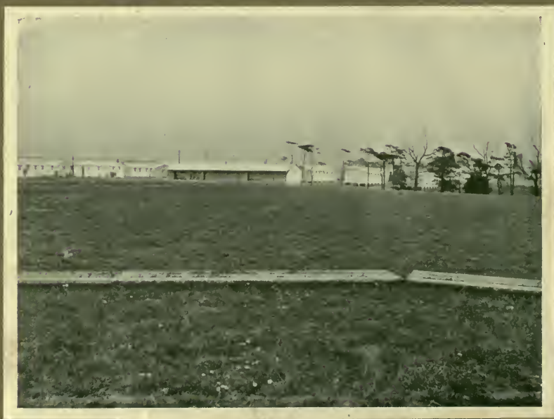
ST. MARTIN'S PLACE SHORNCLIFFE.