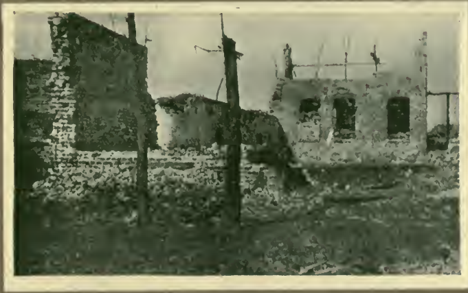
AN OBSERVATION STATION OF THE CANADIAN ARTILLERY.