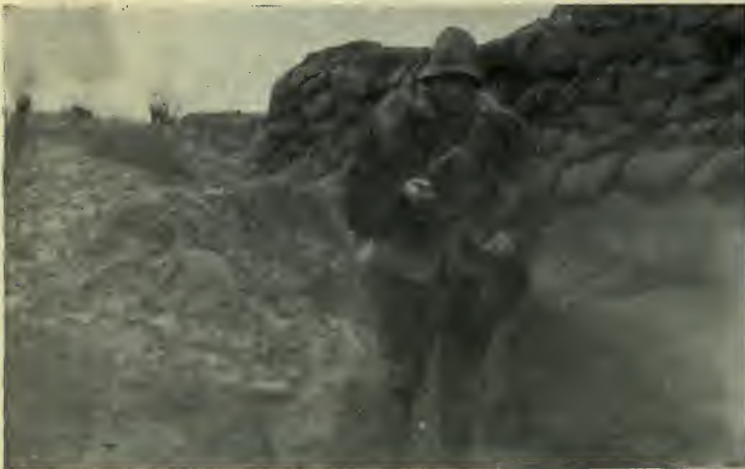
IN WINTER KIT—AT THE F