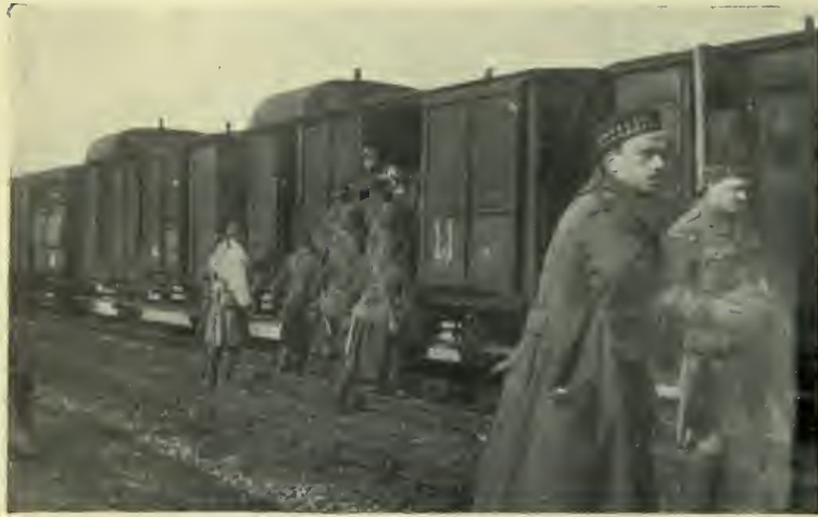
HIGHLANDERS ENTRAINING THE FRONT