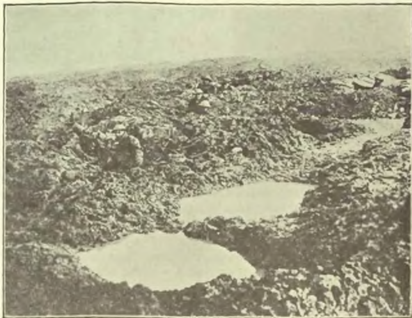
The Machine Guns at Paschendaele

ranks. On the extreme right the 10th got as far as Decline Copse and Hillside Farm, Heine House and Augustus Wood were gathered in as the brigade went beyond its objectives to Deck Wood.