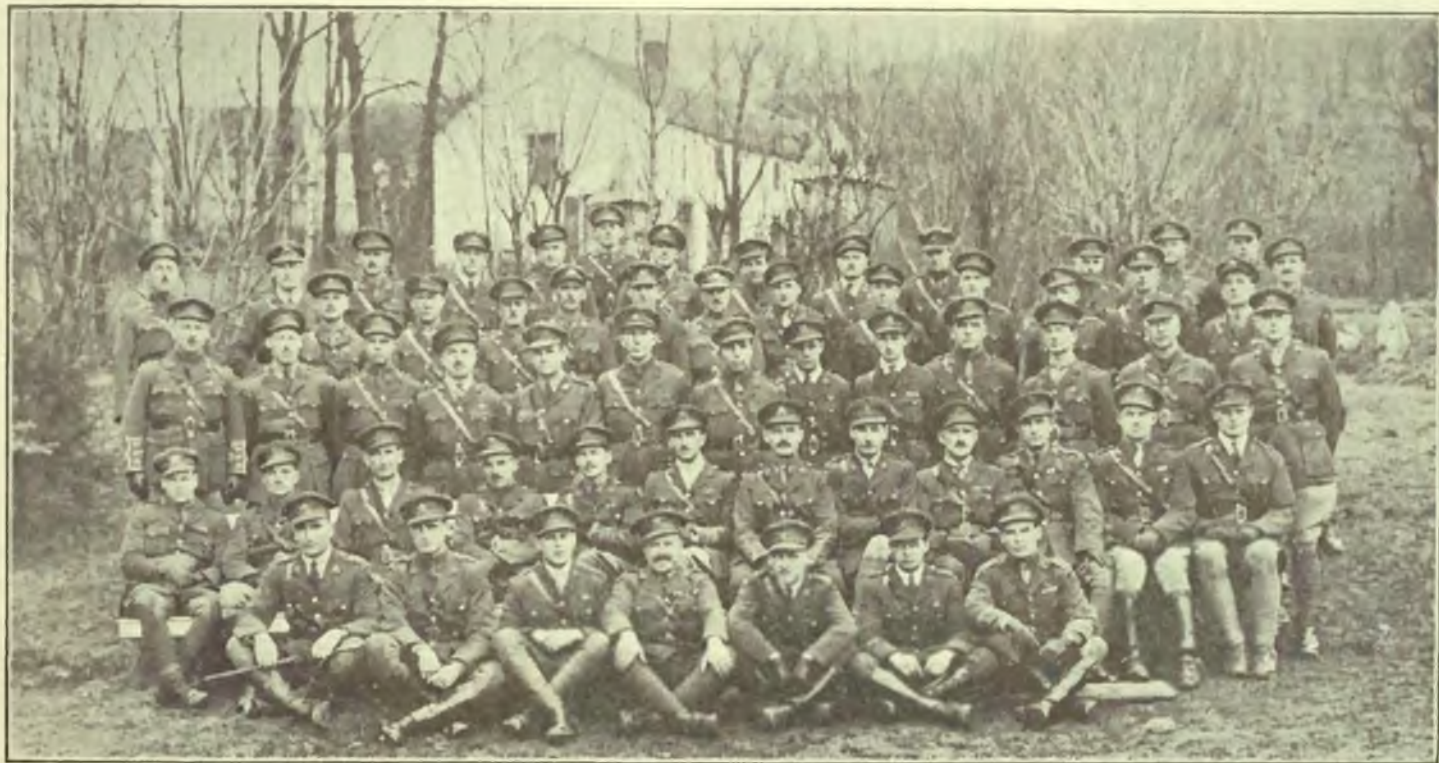
Officers of the 2nd Battalion C. M. G. C.