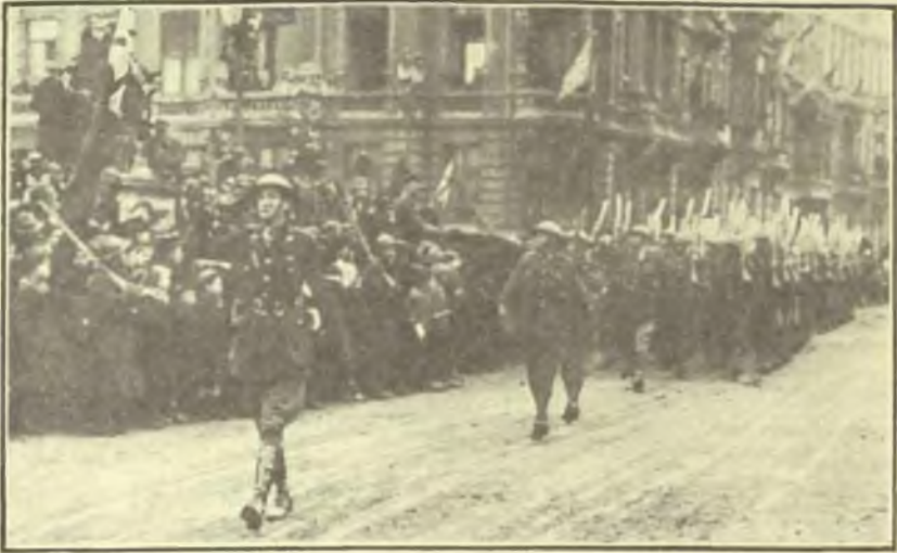
Composite Battery, 1st Battalion C. M. G. C., at Leige review by the Belgian Chief of Staff. 1919.

rendezvous that had been pledged by the Contemptibles over four years before and which their overseas cousins were to make good.