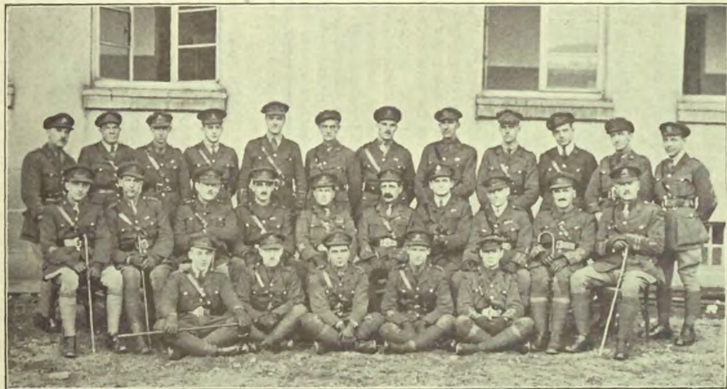
Officers of the 2nd Canadian Motor M. G. Brigade