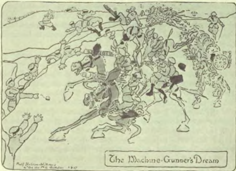
Christmas Card, 4th Canadian M. G. Battalion, France, 1917 - 1918

and billets that generally were dry, clean and comfortable—these were some of the activities and some of the conditions which were to make rest periods out of the line during this winter memorable for war-weary troops.