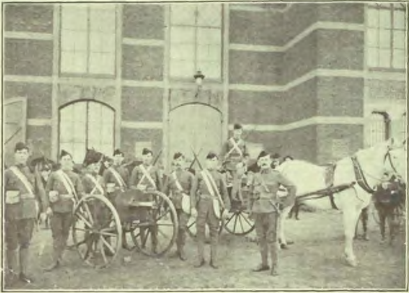
Machine Gun Section, Ottawa, 1901