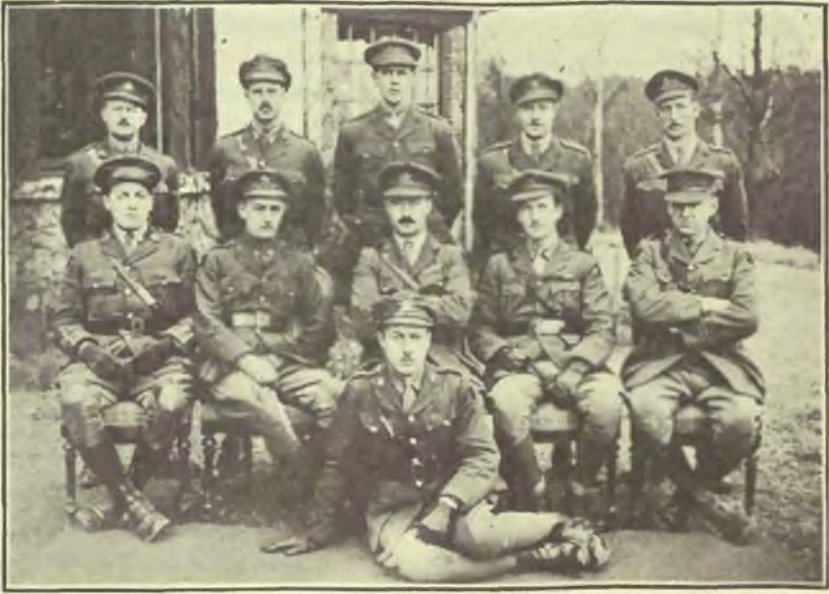
Headquarters, 4th Battalion C. M. G. C.

toward Bloater Trench at the foot of the Ridge and did some fine execution. Enfilade fire from Hill 145 gave the left flank guns of this company many anxious moments. About noon hostile machine gun fire put one of the guns out of action. Two guns were later detached from "E" Barrage Battery to strengthen this threatened point.