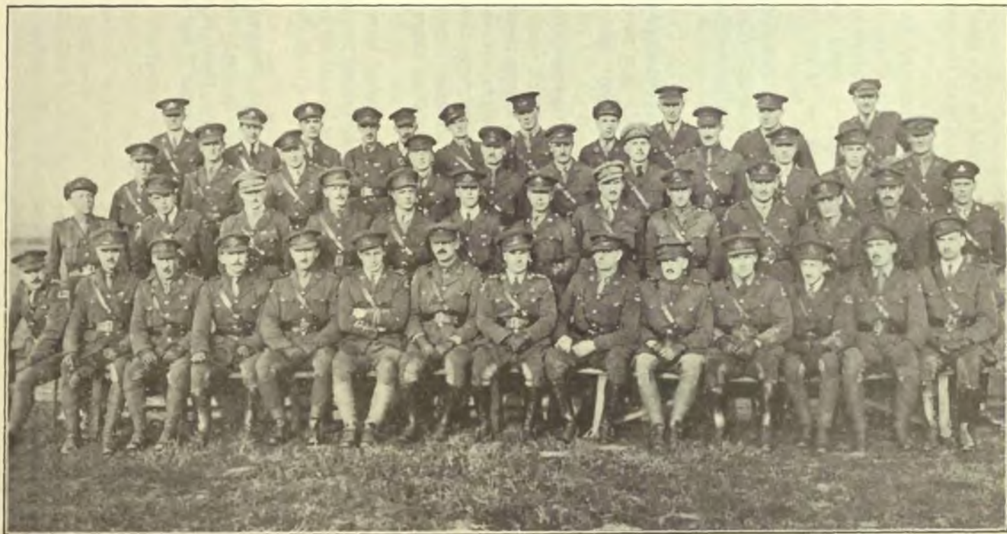
Officers of the 3rd Battalion C. M. G. C.