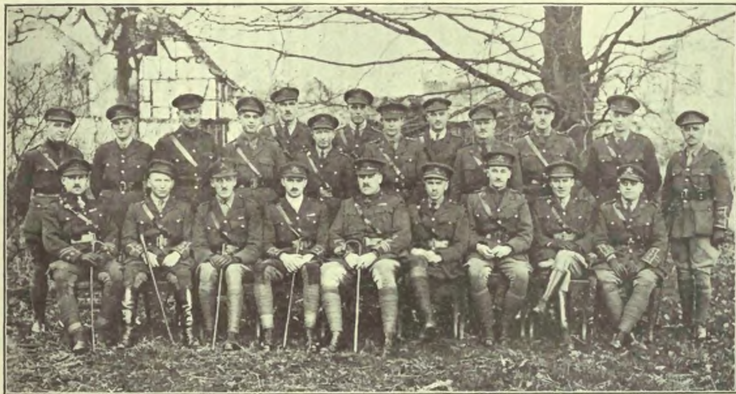
Officers of the 1st Canadian Motor M. G. Brigade