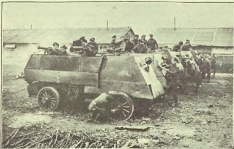
Cleaning Armoured Cars, Canadian Motor M. G. Brigade

Cambrai in November and had missed that one glorious opportunity of which the Canadian Cavalry took such startling advantage.