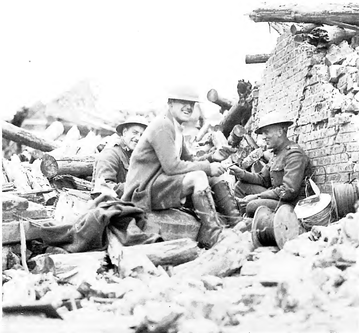
During a brief rest, Canadian Signallers enjoy a light moment resting beside an old German bunker near Lens, September 1918.