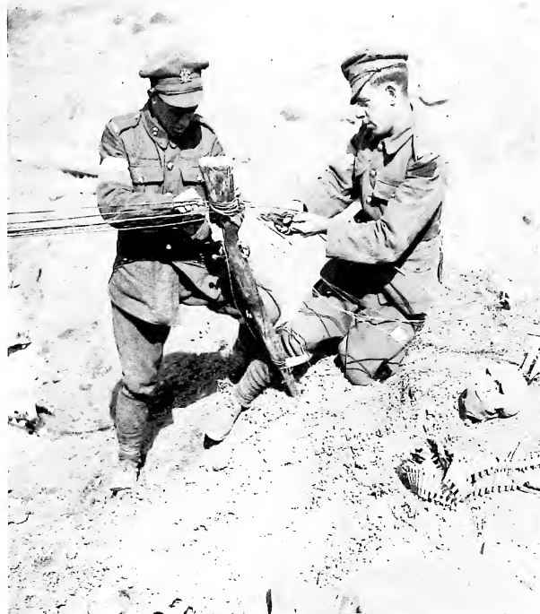
To keep wires off the ground Canadian Signallers use a German rifle as a telephone pole. September 1918.

office had a direct wireless link to the air reconnaissance unit so it could fire on German guns as soon as they were located. 42 While destroying trenches, gunners tried to get one observation aircraft for every one of their six-gun batteries. 43 All-in-all the Royal Flying Corps faced a wide variety of demands as a communications link between gunners and the front line at a time when air operations had become so hazardous the period was later called "Bloody April."