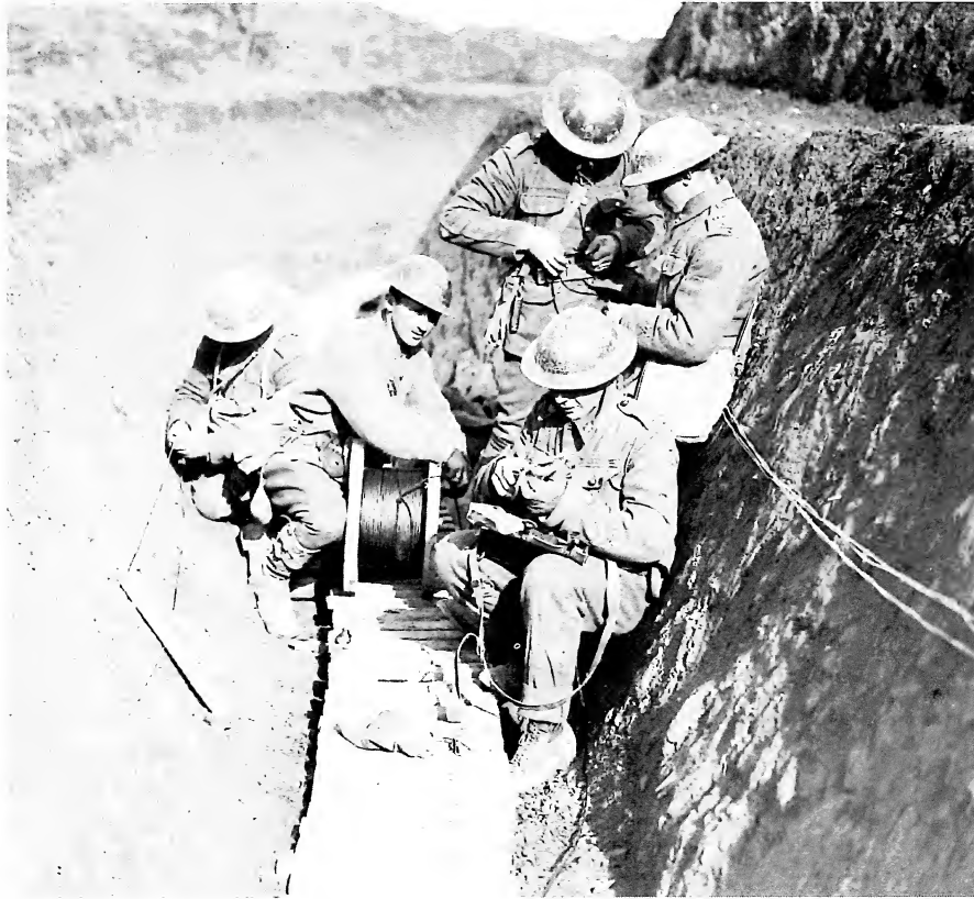
Repairing wire in a communication trench, February 1918.