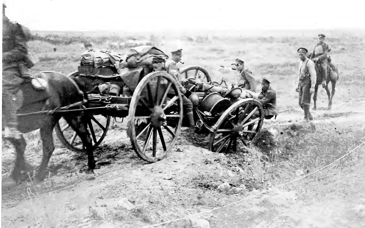
Canadian Signal Section laying cable during the advance east of Arras, September 1918.