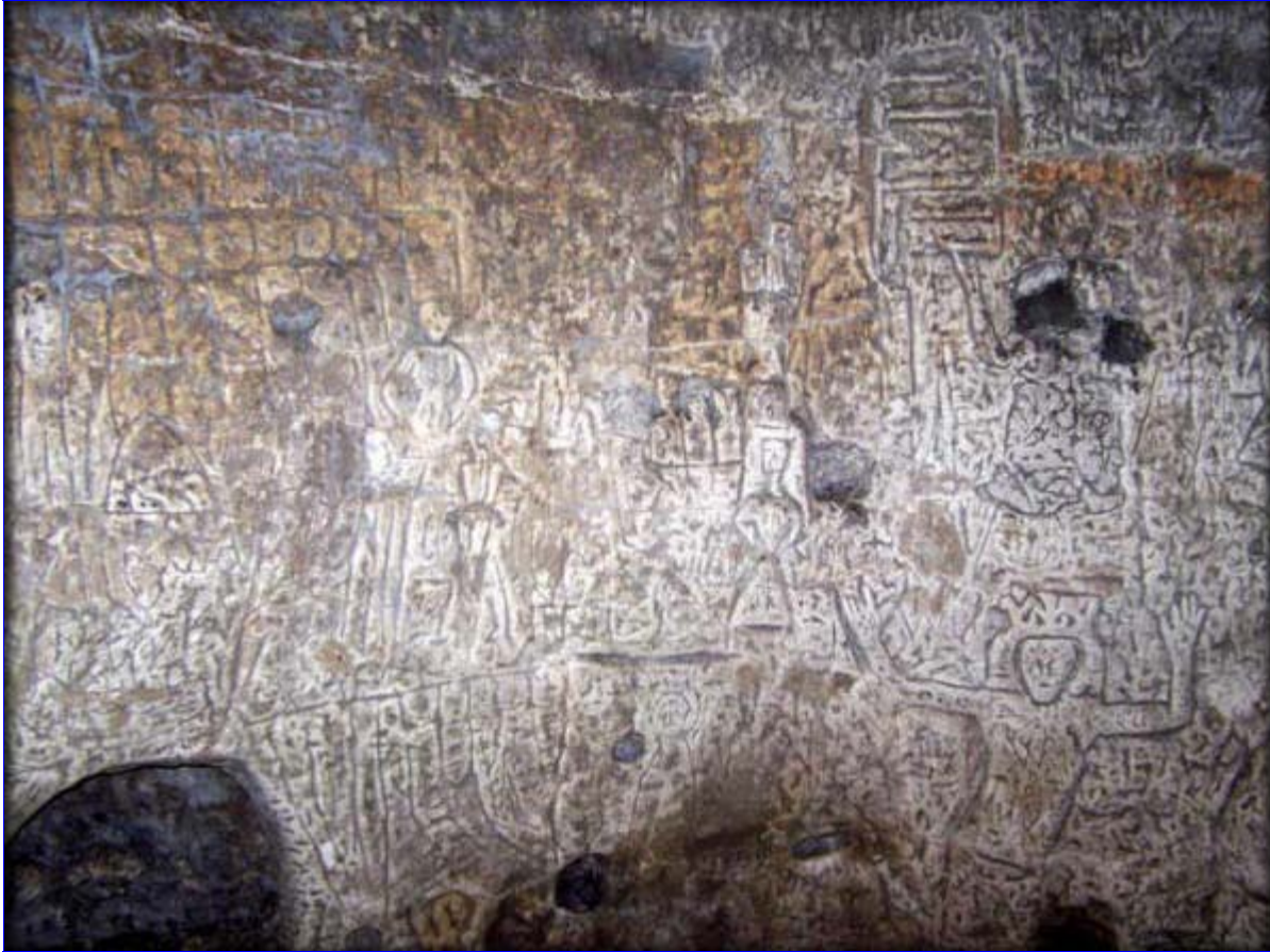
Knights being burnt at the stake See http://www.roystoncave.co.uk/index.html

disappearing before their meaning is solved. Having survived 700 years, the symbols in the ancient cave at Royston, Hertfordshire, are under attack by worms eating the chalk walls behind them. The chamber was shaped out of a 180ft-thick seam of chalk and extends 30ft beneath the centre of the market town. It was discovered in 1742 and the depictions of biblical scenes and portraits of Christian martyrs inside it have confused historians ever since. (guardian.co.uk)