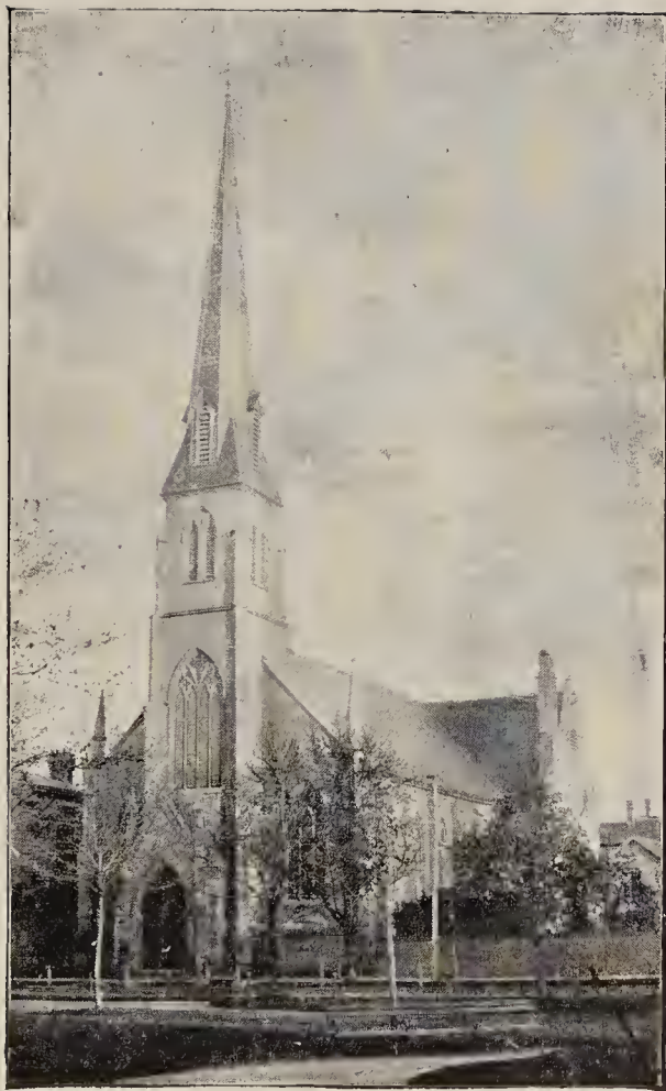
ZION PRESBYTERIAN CHURCH, BRANTFORD.