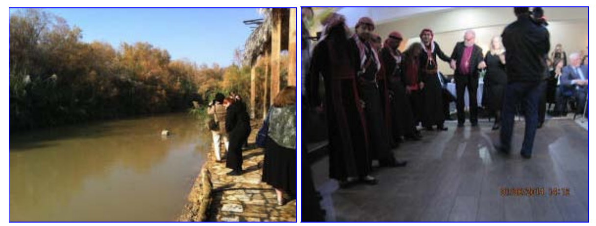
On the banks of the River Jordon and dancing in celebration