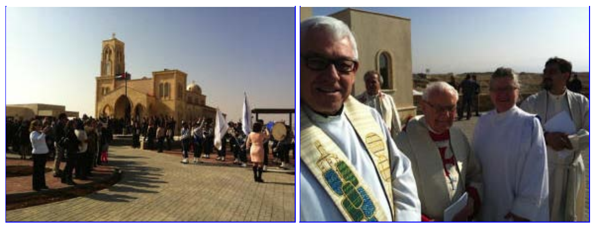
The Lutheran Church on the say of the dedication and the Canadian contingent