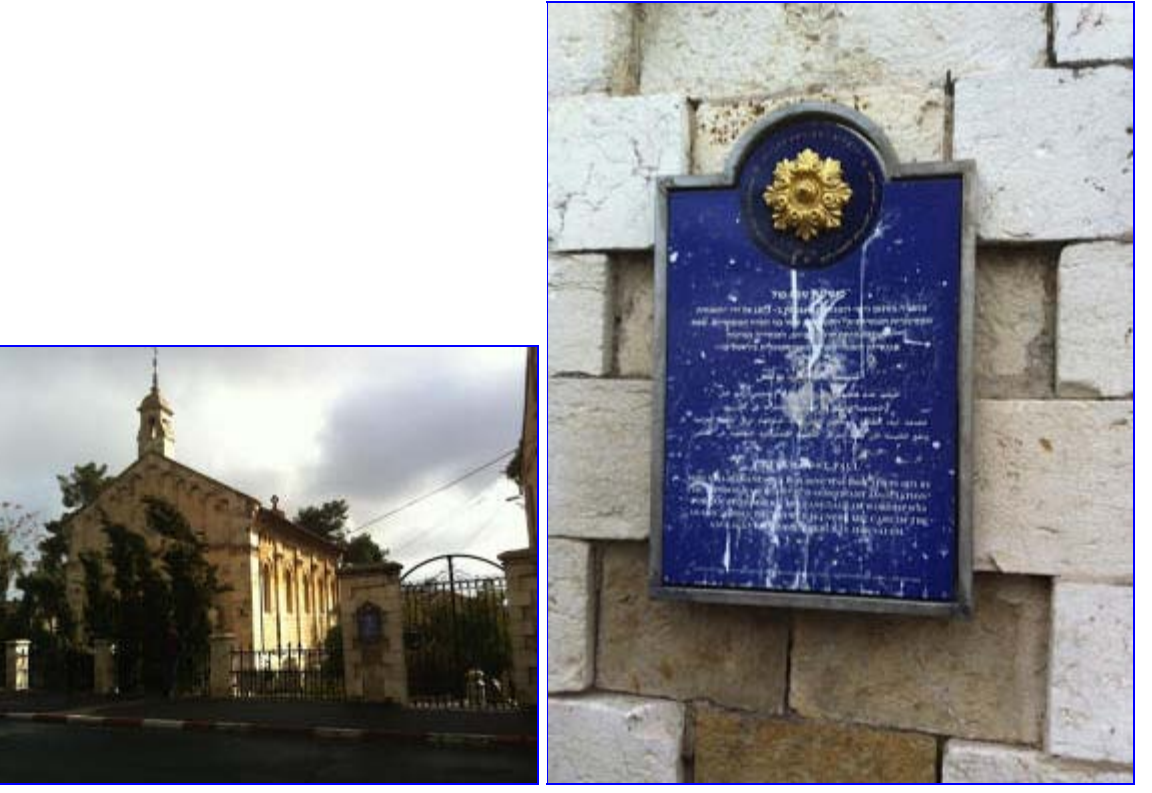
Our Church in Jerusalem and showing the defaced sign