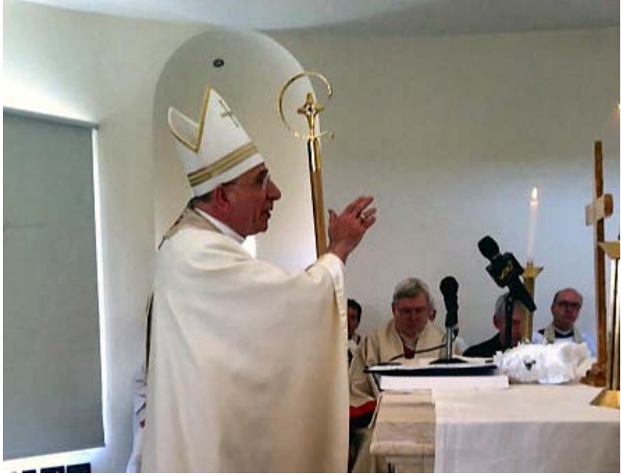
Bishop Yo blessing the congregation

Are you ever asked what the Templars are all about or, why you are a Templar?