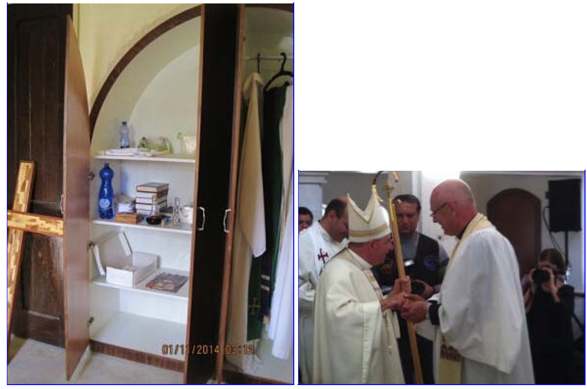
A corner of the Sacristy at St Paul's and Bishop Yo