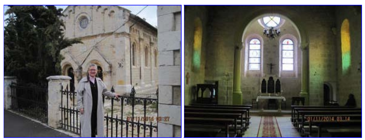
Nola in front of the Arab Christian St Paul's Anglican Church for which we built the sacristy and the Interior of St Paul's