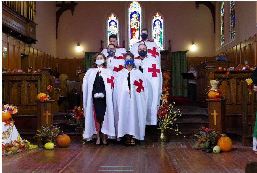
The six newest Templars: